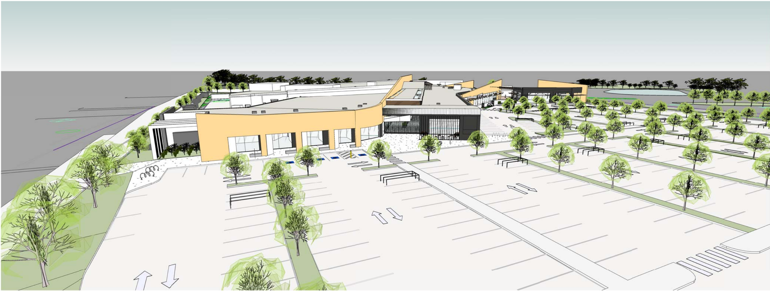
AERIAL VIEW FROM APPROVED ACCESS ROAD