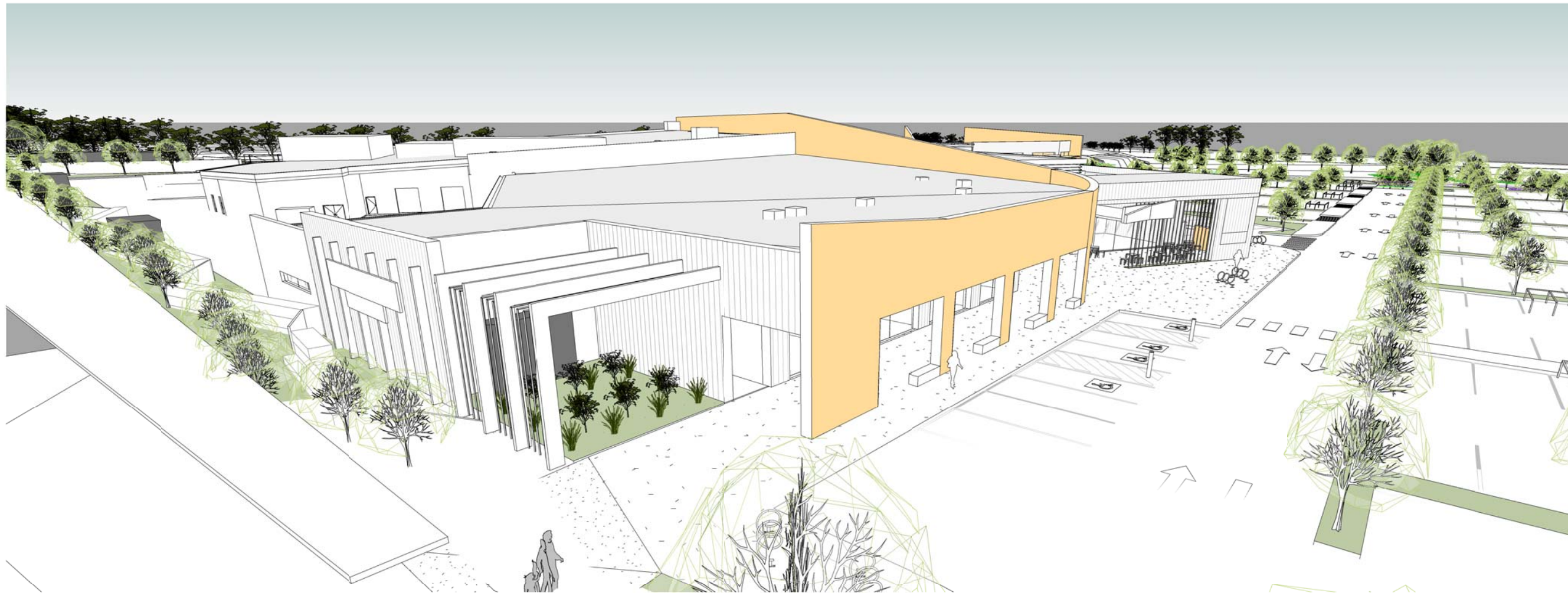
AERIAL VIEW FROM PEDESTRIAN ENTRY OFF ROOTY HILL ROAD SOUTH