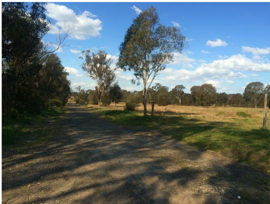
BEGGS ROAD SOUTH WEST