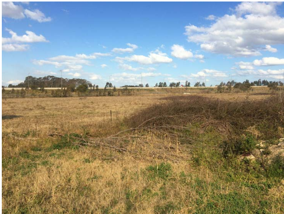
CHURCH STREET EAST TOWARDS M7 WEST LINK