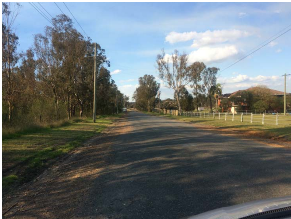
CHURCH STREET EAST