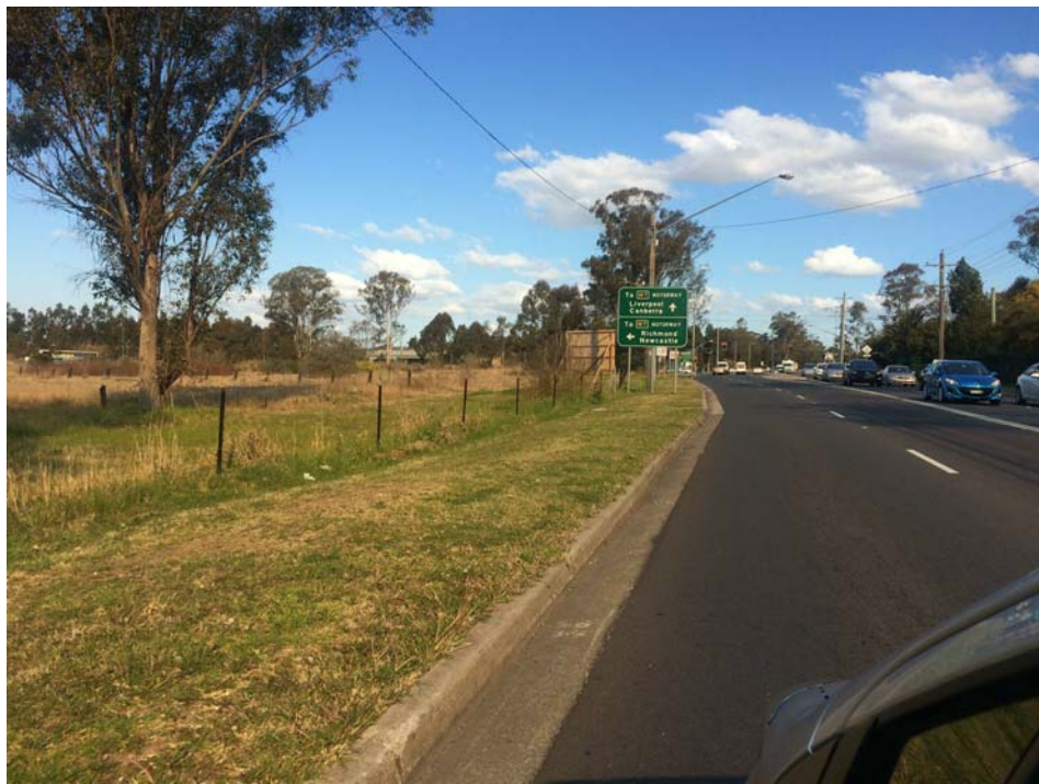
ROOTY HILL ROAD SOUTH TOWARDS GREAT WESTERN HIGHWAY INTERSECTION