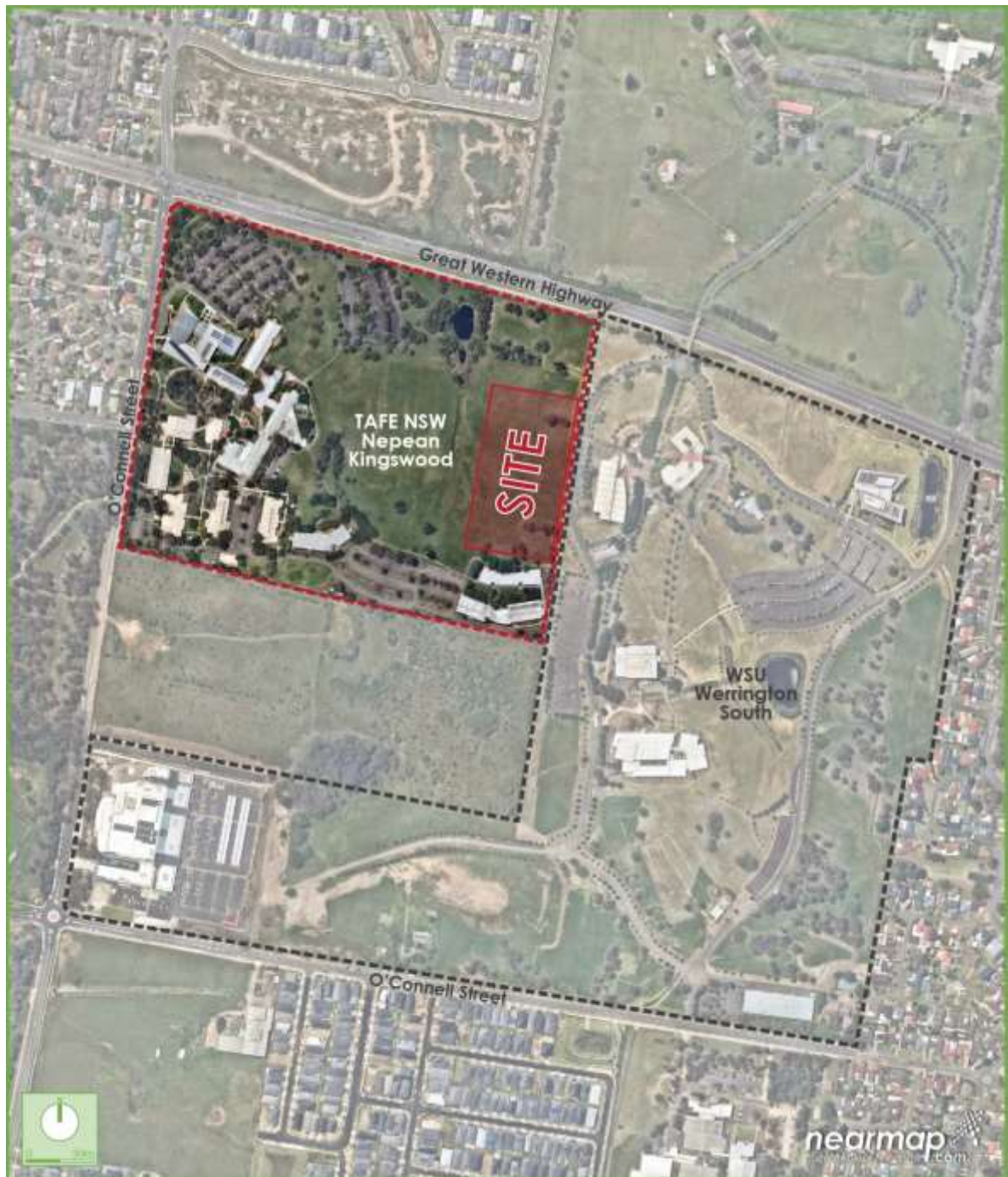
Figure 2: Site Plan