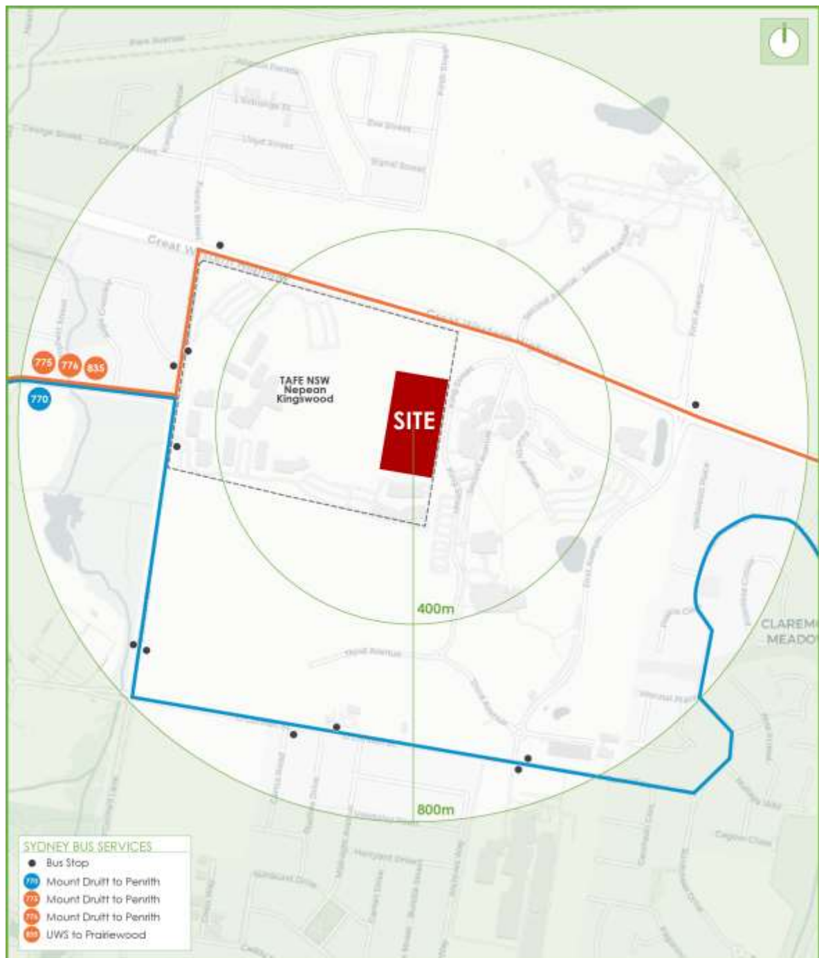
Figure 3: Public Bus Routes