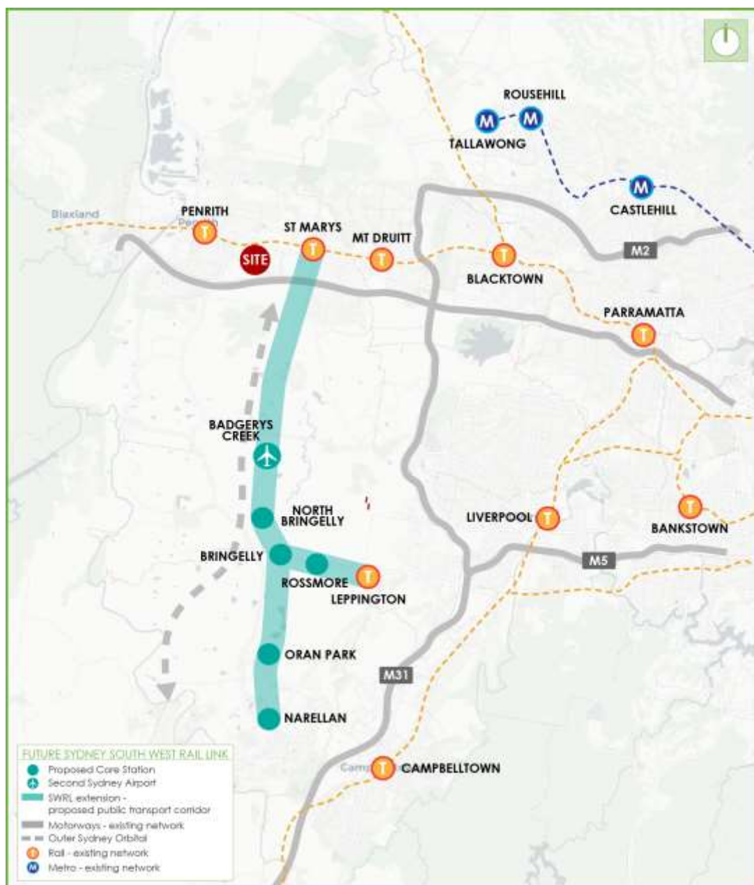
Figure 4: Metro Services

In future, students and staff who may live in other suburbs can take advantage of the metro service to get to the site and services will be frequent (approximately every 5-10 minutes, in line with other Sydney Metro projects). This is presented in Figure 4 below.