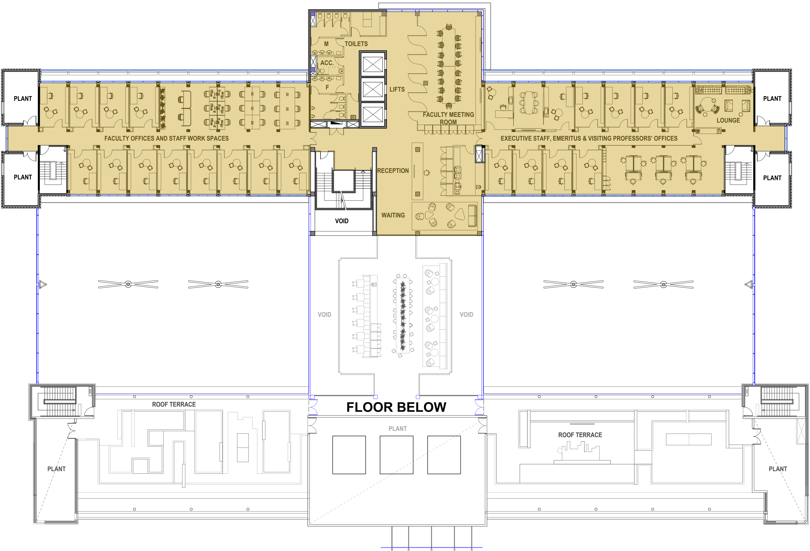
25 WALLY'S WALK B - LEVEL 7

Ryde Local Environment Plan 2014 gross floor area means the sum of the floor area of each floor of a building measured from the internal face of external walls, or from the internal face of walls separating the building from any other building, measured at a height of 1.4 metres above the floor, and includes: (a) the area of a mezzanine, and (b) habitable rooms in a basement or an attic, and (c) any shop, auditorium, cinema, and the like, in a basement or attic, but excludes: (d) any area for common vertical circulation, such as lifts and stairs, and (e) any basement; (f) storage, and (g) any area for common vertical circulation, such as lifts and stairs, and (h) any space used for the loading or unloading of goods (including access to it), and (i) terraces and balconies with outer walls less than 1.4 metres high, and (j) voids above a floor at the level of a storey or storey above.