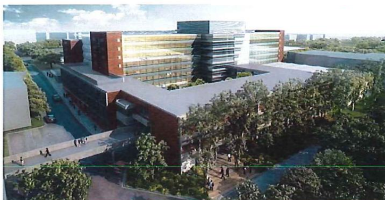
Figure 3; Image of Design Proposal looking south

Macquarie University proposes to redevelop and expand its Art Precinct comprising buildings W6A, W6B and its associated courtyard which was built in 1967. These buildings have since undergone a number of fit-outs over the years. The primary objective of the project is to create a revitalised precinct for the Faculty of Arts that reflects the desired culture within the faculty as well as creating a space for the broader University Community. This will be achieved by undertaking a lifecycle upgrade, renewal & interior fit out of buildings W6A , W6B and construction of a Future Building (25WWC)