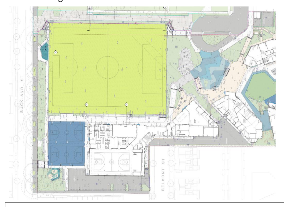
Figure 1 – Proposed Alexandria Park Community School sports fields

This assessment includes the acoustic investigation into the potential for noise impacts from the activities included above on the proposed sports fields as detailed in the figure below.