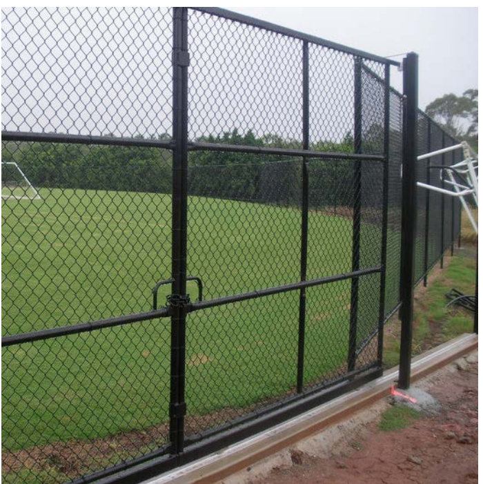
*colour not indicative of final design