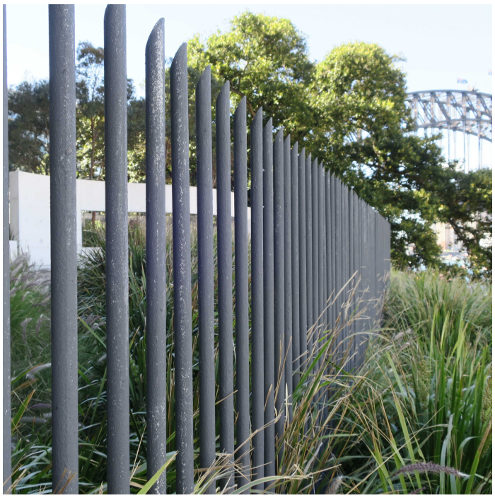
SCULPTURAL FENCE TO BLEND WITH PLANTING LEDA - 'BASTILLE' FENCE [FB32R] (STANDARD SECURITY FENCE)