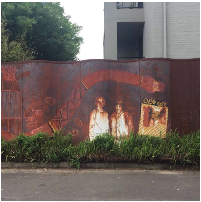
EXISTING CORTEN STEEL FENCE WITH PUBLIC ARTWORK