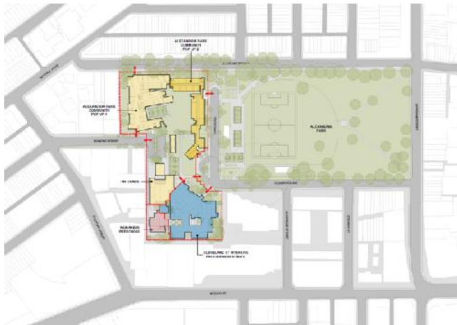
Image: 2018 site plan locating pop-up 1, pop-up 2 and CSIEHS. Image Credit: TKD Architects.

Further information on this project can be found on the CSIEHS project page.