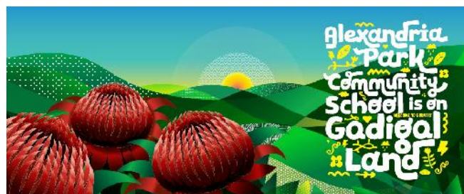
One of the graphic murals that will be installed on The Buckland buildings. Image credit: Leading Hand Design and Danilo Brandao at Boccalatte.

and fauna to represent the four school houses (Waratah, Wattle, Blue Gum and Banksia) and make reference to the recently demolished mural that existed along the public pathway between Belmont and Buckland Streets.