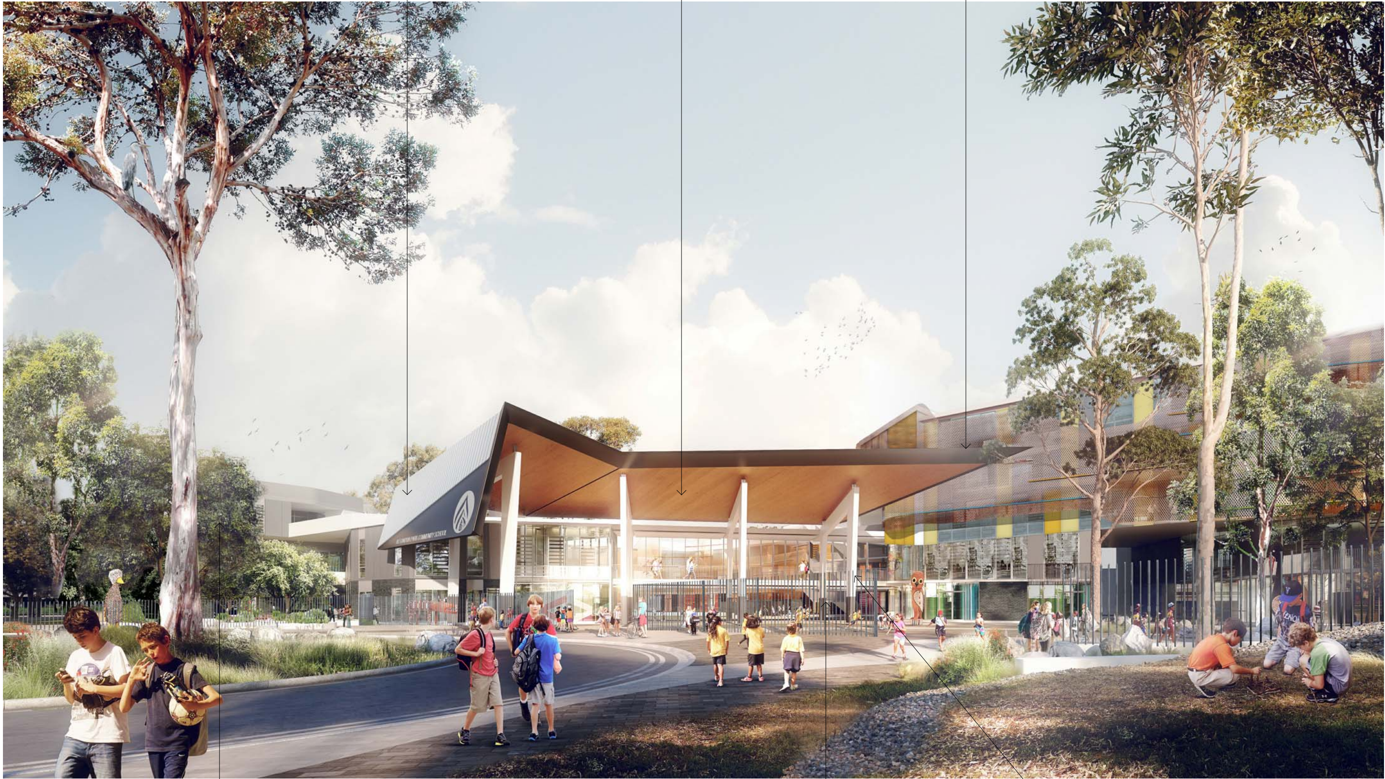
COMPRESSED FIBER CEMENT SHEETING (CFC)