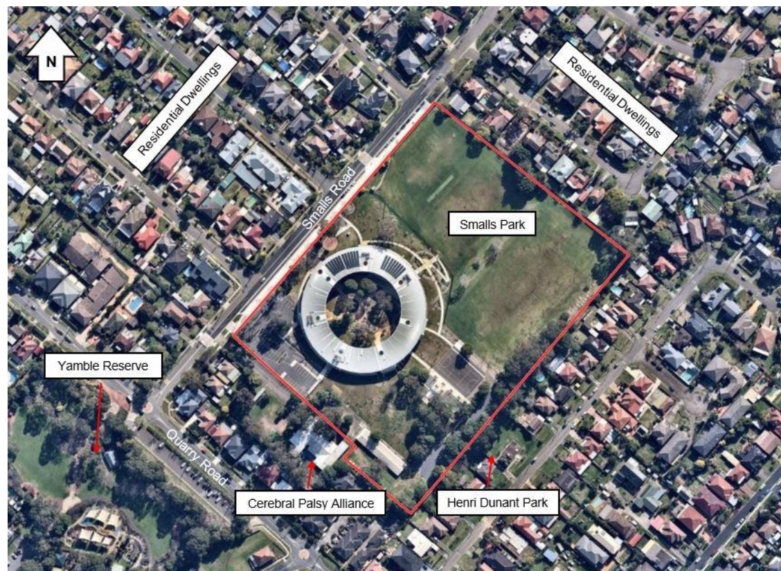
Figure 2 | Local Context Map