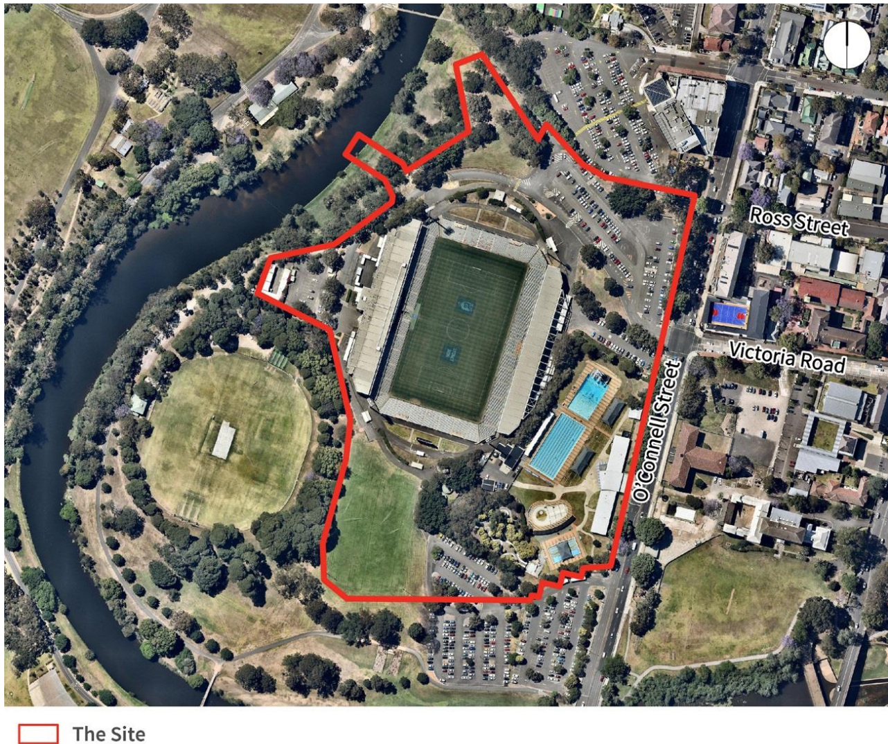
Figure 1.2 – Site Aerial Plan

The site is irregular in shape and is illustrated in Figure 1.2 below.