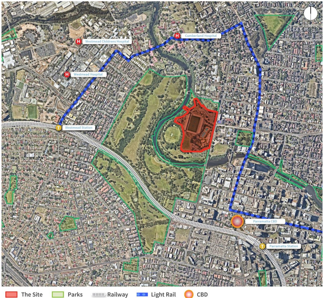
Figure 1.1 – Site Context Plan

The site has an area of approximately 95,000m 2 and owned by Venues NSW and The Parramatta Park Trust.