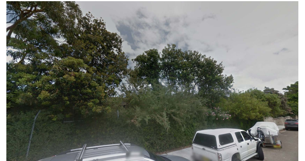
View 02 Existing 'greenwall' views