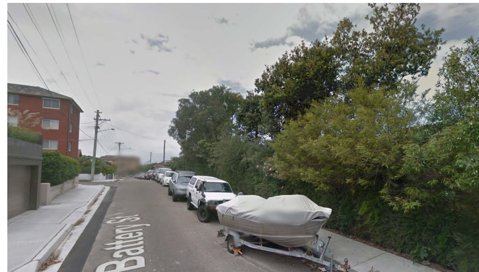
View 01 Existing 'greenwall' views

Building works in this area be supervised by the project Arborist to ensure existing trees to be retained are protected during construction.