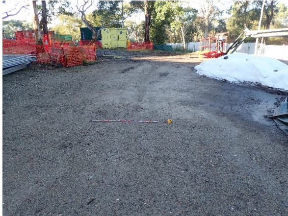
Figure 3 – Western section of the proposed Impact Area, facing south-east.