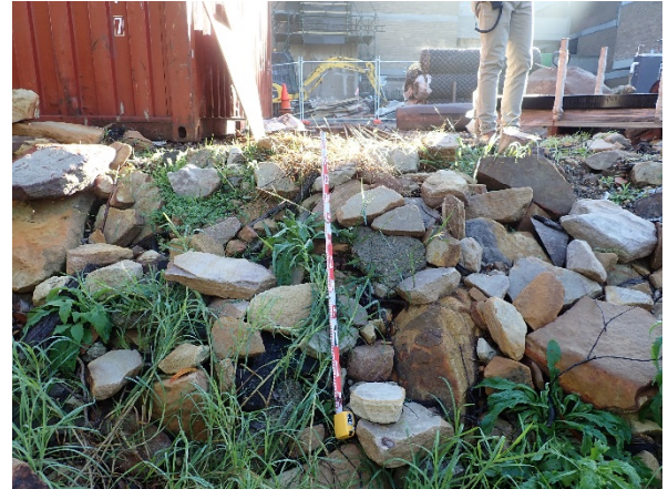
Figure 4 – Edge of imported fill placed on the southern perimeter of the Subject Area, facing north.