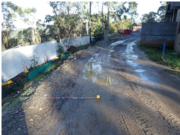
Figure 5 – Eastern section of the Impact Area, facing south-west.