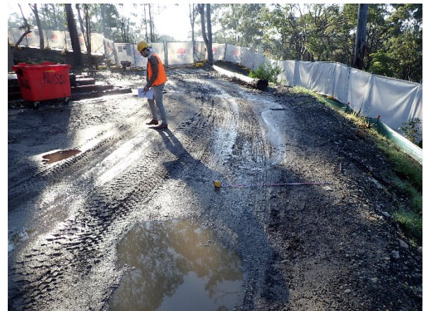
Figure 6 – Eastern section of the Impact Area, facing north-east.