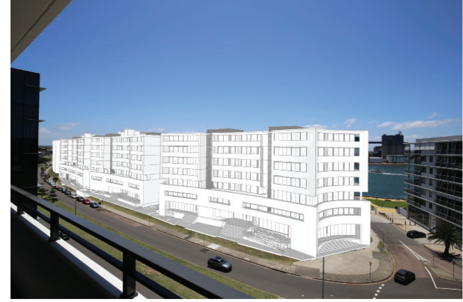
View 3 18 Honeysuckle Drive - Residential Level 6