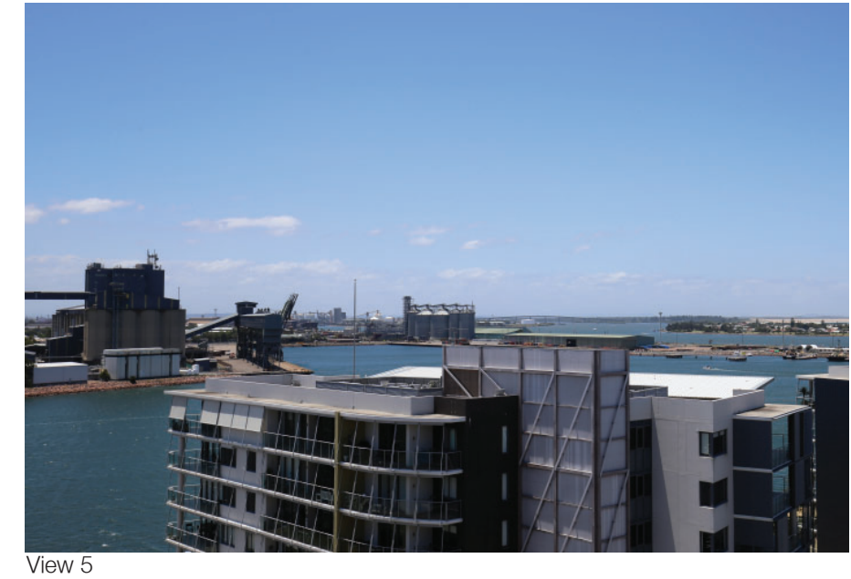
18 Honeysuckle Drive - Residential Level 9