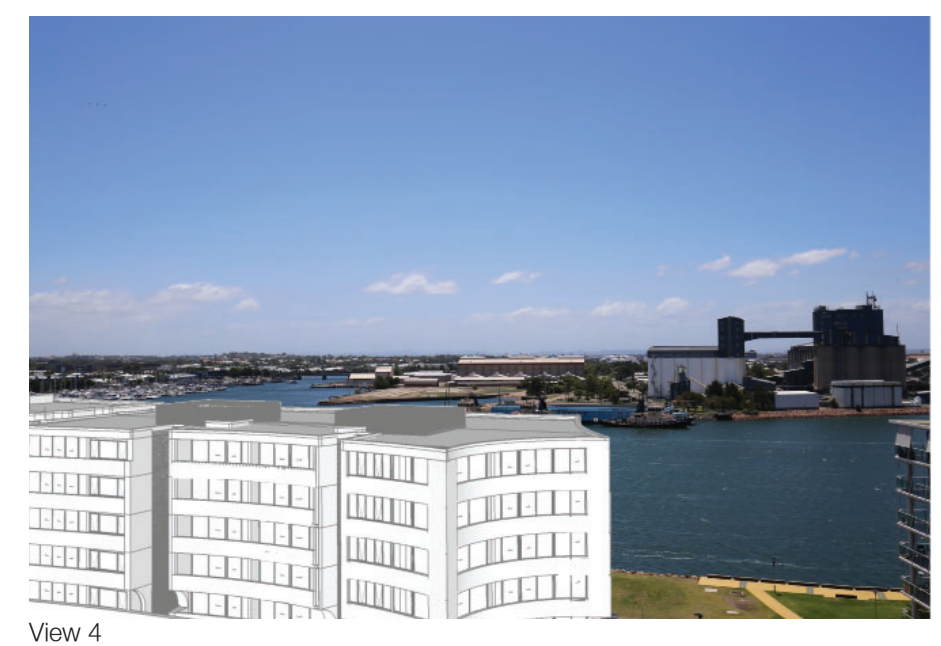
18 Honeysuckle Drive - Residential Level 9