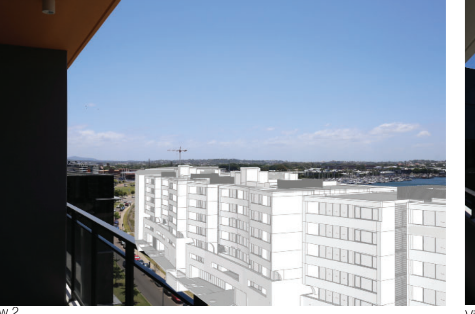
View 2 18 Honeysuckle Drive - Residential Level 9