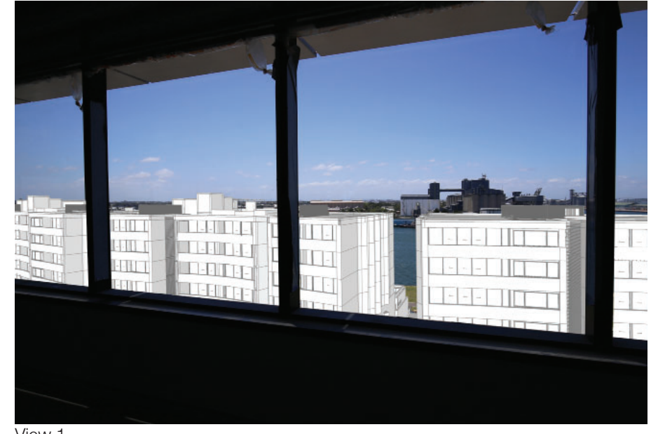
View 1 18 Honeysuckle Drive - Commercial Level 7