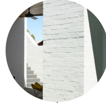
White Painted Brick