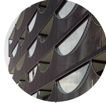
Vertical Metal Screen