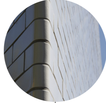
Glazed White Brick