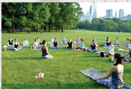
EXAMPLE PHOTOS: OPEN TURF ACTIVITY