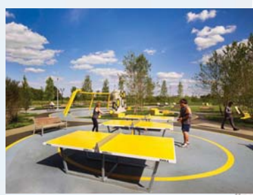
EXAMPLE PHOTOS: EXERCISE AND ACTIVITY