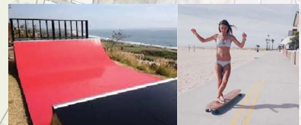
EXAMPLE PHOTOS: SKATEABLE FEATURES

ACTIVITY NODE & PLAYSACE TO INCLUDE A VARIETY OF PLAYGROUND & EXERCISE EQUIPMENT PIECES SUITABLE FOR TEENAGERS HIGHER LEVELS OF ABILITY. PLAYGROUND EQUIPMENT TO BE NATURE BASED WHERE SUITABLE. RUBBER SOFTFALL TO SURFACE WITH MOUNDING AND SHAPING FOR INTEREST AND VARIETY.