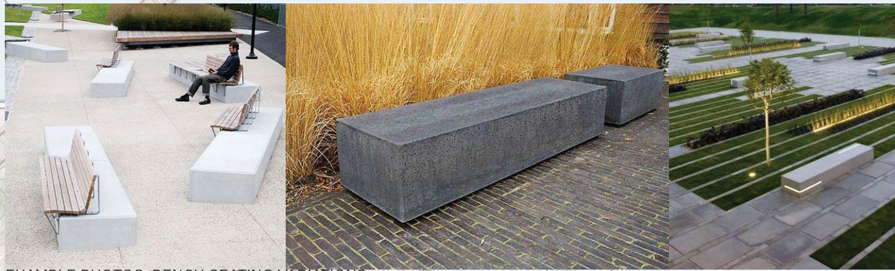
EXAMPLE PHOTOS: BENCH SEATING VARIATIONS