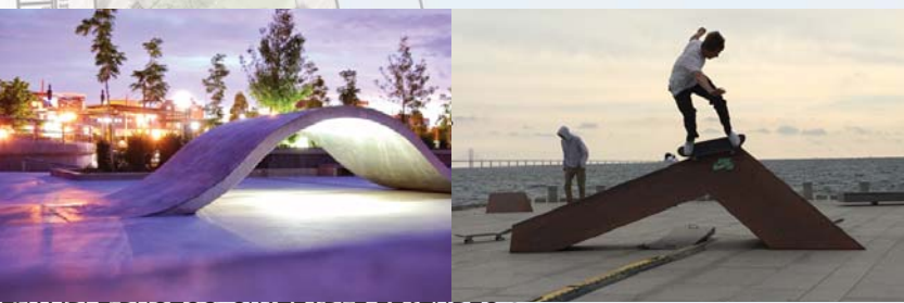
EXAMPLE PHOTOS: SKATEABLE FEATURES