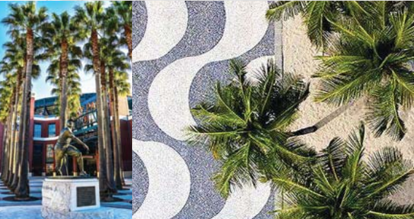
EXAMPLE PHOTOS: FEATURE PALM TREES

EXISTING ASPHALT CARPARK TO BE RETAINED, IMPROVED AND UPGRADED. CONTAMINATED CONTAINMENT CELL BENEATH PREVENTS ANY GROUND PENETRATIONS OR ADDITIONAL TREE PLANTING.