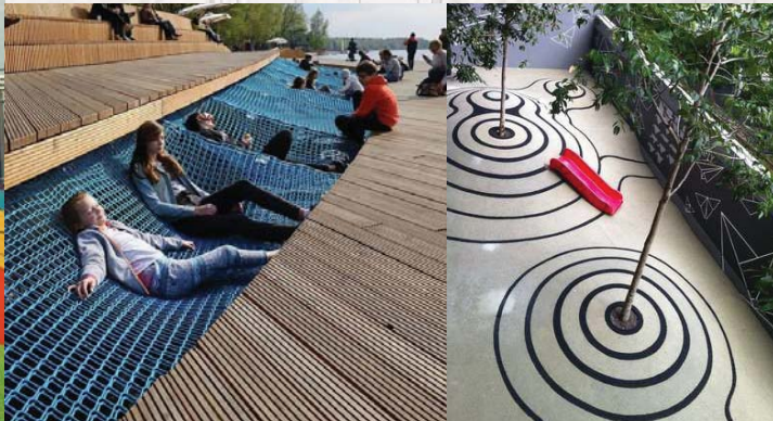
EXAMPLE PHOTOS: CHILDRENS PLAYGROUND