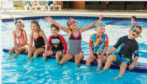
EXAMPLE PHOTOS: TODDLER POOL