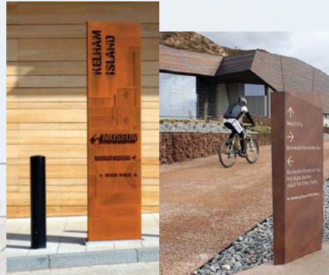
EXAMPLE PHOTOS: WAY FINDING SIGNAGE

SHORT-TERM PARALLEL CARBAYS FOR PATRON DROP-OFF AND PICK UP