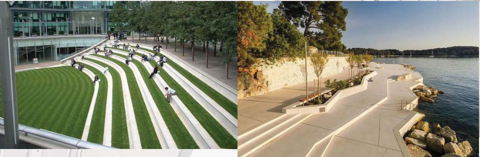
EXAMPLE PHOTOS: 'THE HILL'

FEATURE SEATING PODS PROVIDE MORE PRIVATE SITTING AND GATERING SPACES FOR COUPLES, FAMILIES OR SMALL GROUPS AND DESIGNED TO REINFORCE THE RESORT STYLE AESTHTIC OF THIS ZONE.