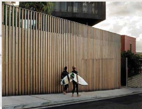
EXAMPLE PHOTOS: SCREEN FENCING

RAISED PLANTING BED AREA PLANTED WITH NATIVE TREE AND SHRUB SPECIES TO PROVIDE VISUAL AND NOISE SCREENING FROM CARPARK. FORMED CONCRETE WALL PROVIDES SEATING EDGE WITH GARRISON STYLE SECURITY FENCING PREVENTING UN-AUTHORISED ACCESS FROM CARPARK