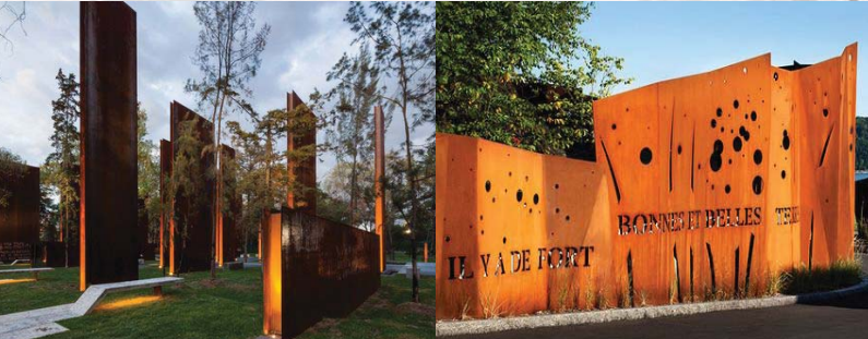
EXAMPLE PHOTOS: ENTRY STATEMENT SIGNAGE

LANDSCAPE TREATMENTS, FINISHES AND FURNITURE TO BE CONTINUOUS AND CONSISTENT TO LINK THROUGH TO THE MAIN LOU FACILITY AND COVE LOUNGE