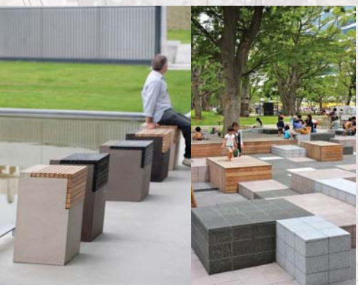
EXAMPLE PHOTOS: PLAZA SEATING