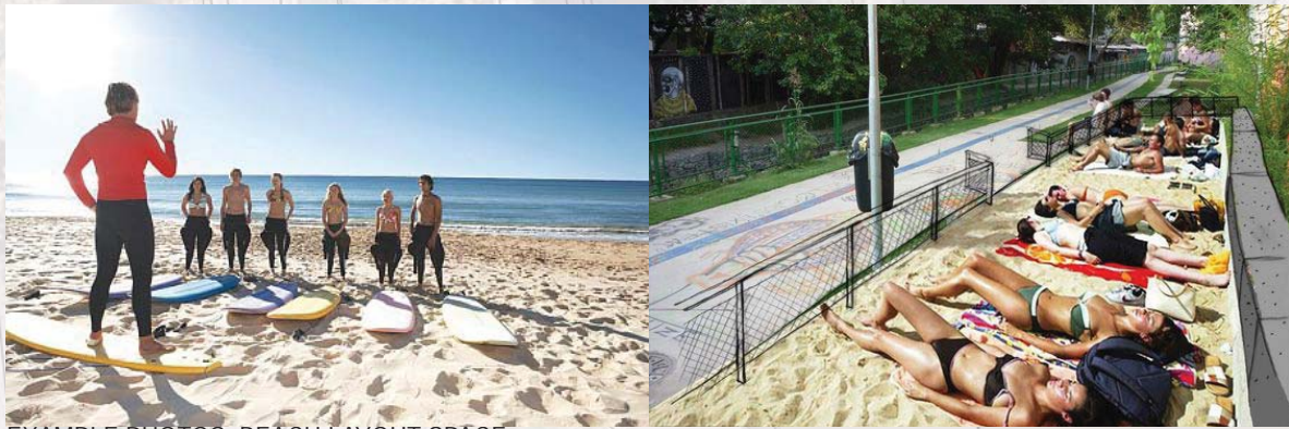
EXAMPLE PHOTOS: BEACH LAYOUT SPACE

SURF ACADEMY TRAINING AREA WITH BEACH CABANA'S OR SHADE STRUCTURES OVER BEACH SAND PIT FOR GATHERING OF GROUPS AND CLASSES OR SITTING AND WAITING SPACES FOR FAMILIES AND FRIENDS WITH VIEWS OVER THE SURF LAGOON