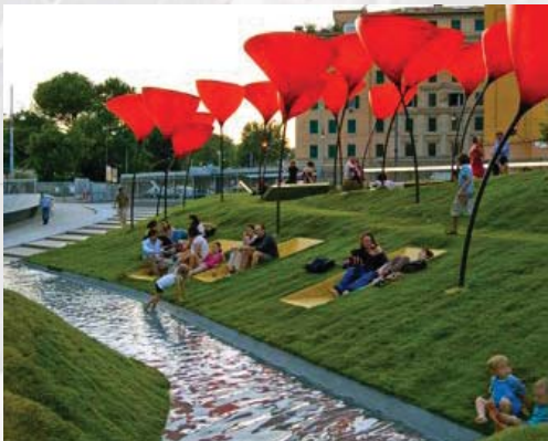
EXAMPLE PHOTOS: TURF BATTERS