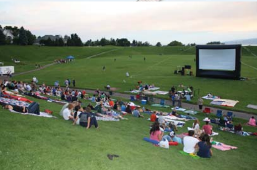
EXAMPLE PHOTOS: TURF EVENT SPACE