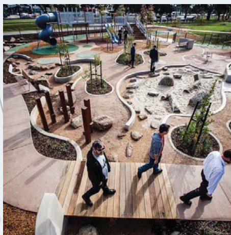
EXAMPLE PHOTOS: NATURE PLAY