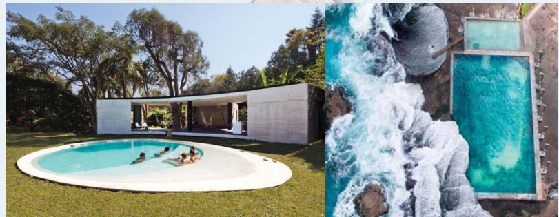
EXAMPLE PHOTOS: WADING POOLS

2.0m WIDE PIER OR JETTY BOARDWALK LEADING OUT TO CENTRAL VIEWING PLATFORM CONSTRUCTED OF TIMBER OF MODWOOD DECKING. PIER PROVIDES VIEWS OVER THE SURF LAGOON AND BACK TO BUILT FORM FACILITIES.