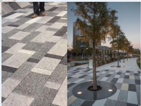
EXAMPLE PHOTOS: PLAZA PAVING