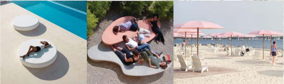
EXAMPLE PHOTOS: THE COVE LOUNGE SEATING OPTIONS

MAIN PICNIC AND GATHERING AREA IN FRONT OF THE CAFE TO INCORPORATE A VARIETY OF SEATING TYPES AND MULTI-FUNCTIONAL USES ALL OVER-LOOKING THE SURF LAGOON.