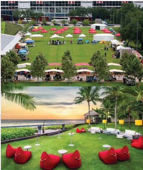
EXAMPLE PHOTOS: TURF EVENT SPACE