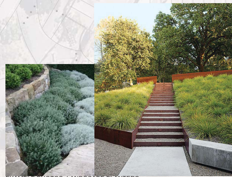
EXAMPLE PHOTOS: LANDSCAPE PLANTERS