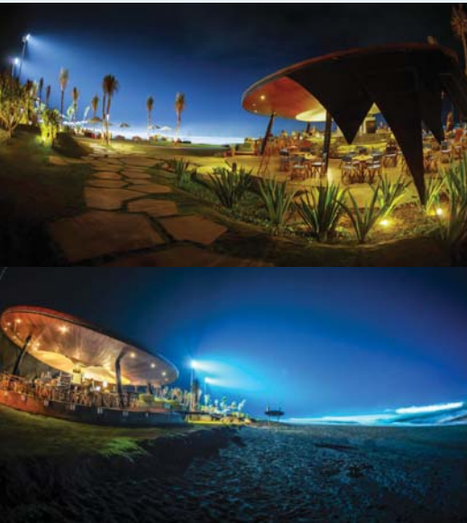
EXAMPLE PHOTOS: NIGHT LIGHTING SURF