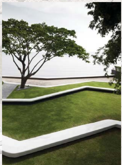
EXAMPLE PHOTOS: TERRACED TURF

FORMED CONCRETE WALLS EXPAND TO CREATE ENLARGE TURF TERRACES FOR INFORMAL GATHERING, PICNIC AND SUNBATHING WITH ELEVATED VIEWING OVER THE SURF LAGOON