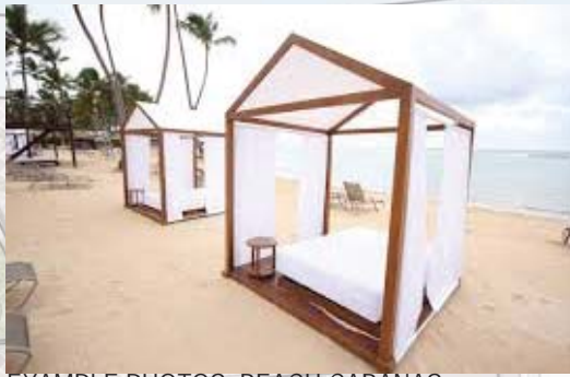
EXAMPLE PHOTOS: BEACH CABANAS

STADIUM FLOOD LIGHTING TOWER TO PROVIDE NIGHT LIGHTING OVER THE SURF LAGOON EXTENDING HOURS OF USE AND FOR SPECIALTY EVENTS.