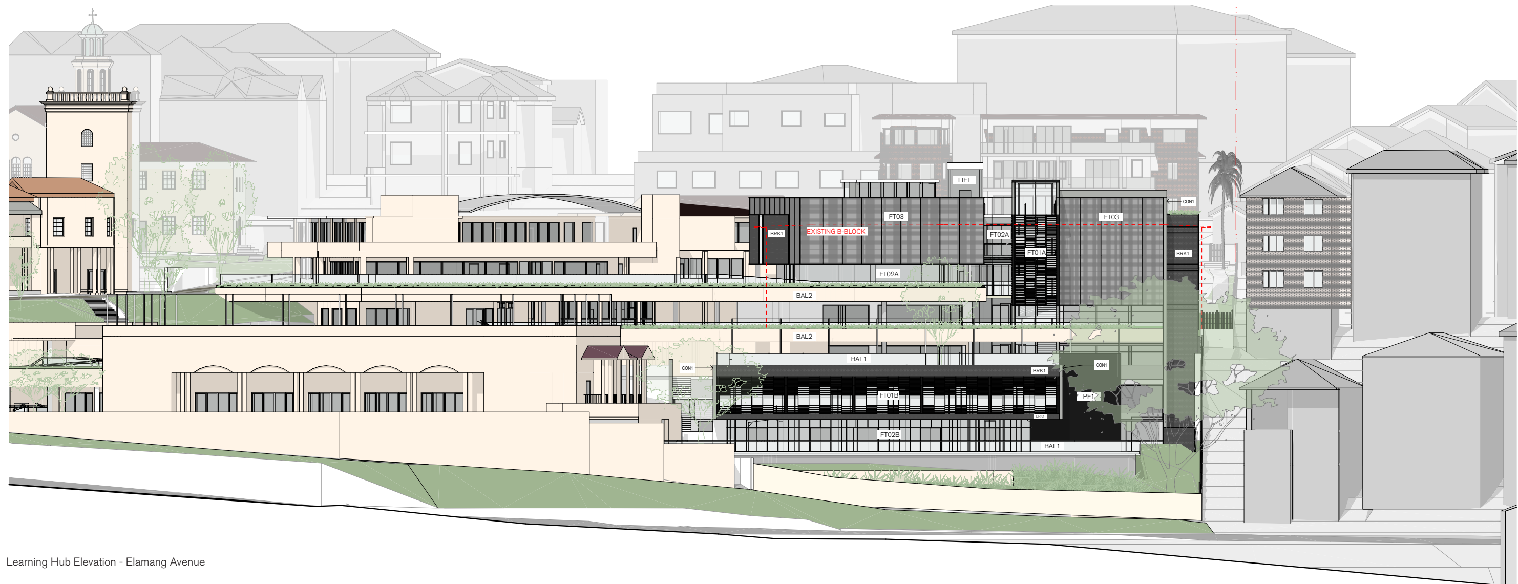
Learning Hub Elevation - Elamang Avenue