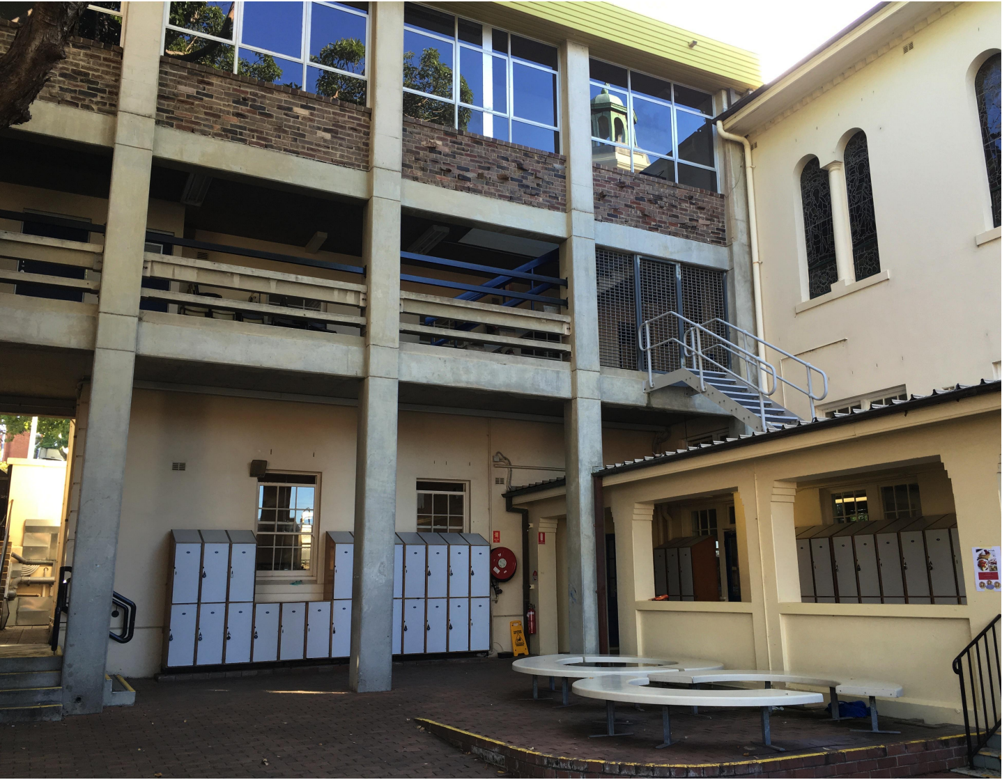
2 J-Block Chapel connection