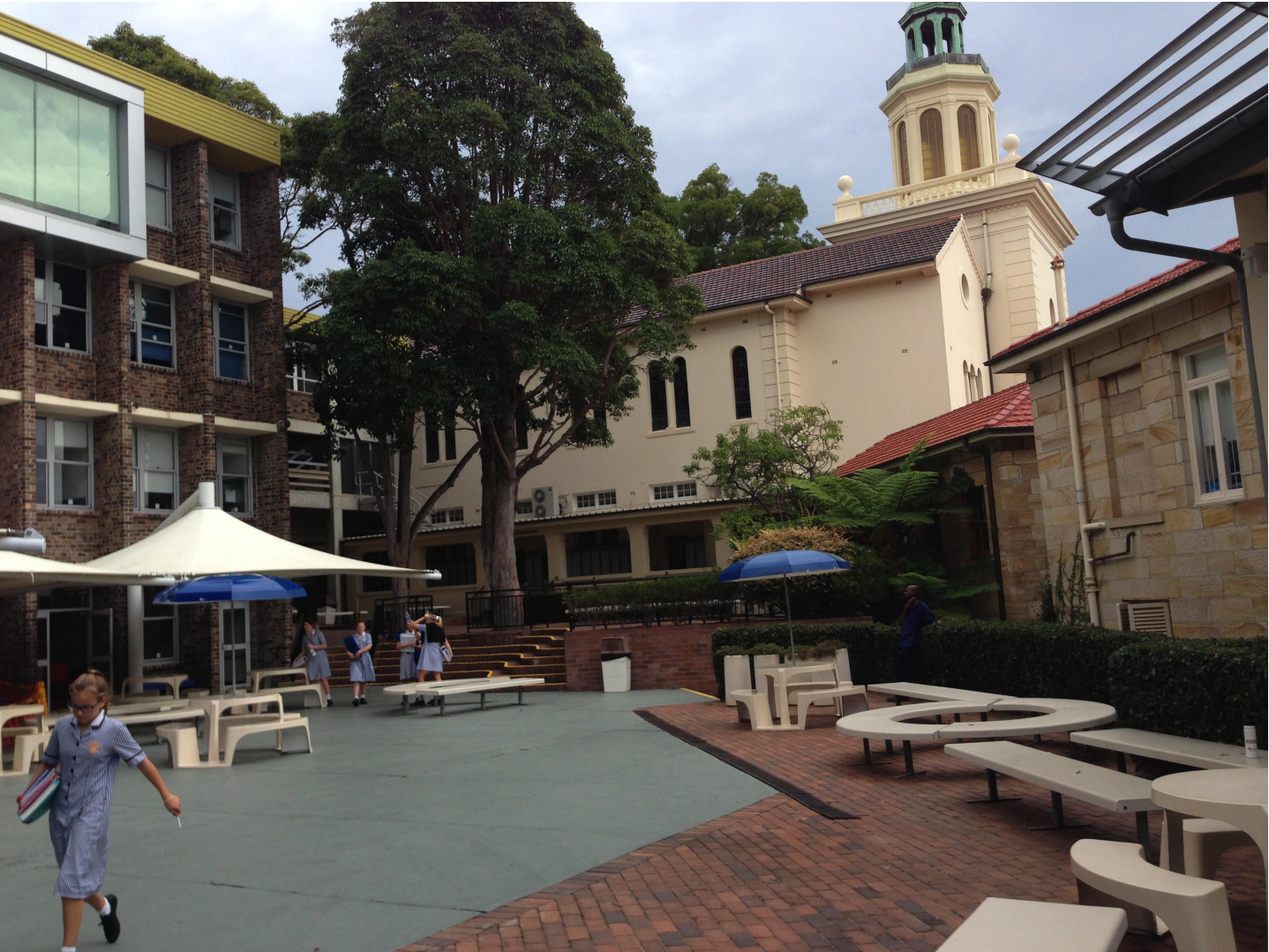
1 Courtyard towards Chapel