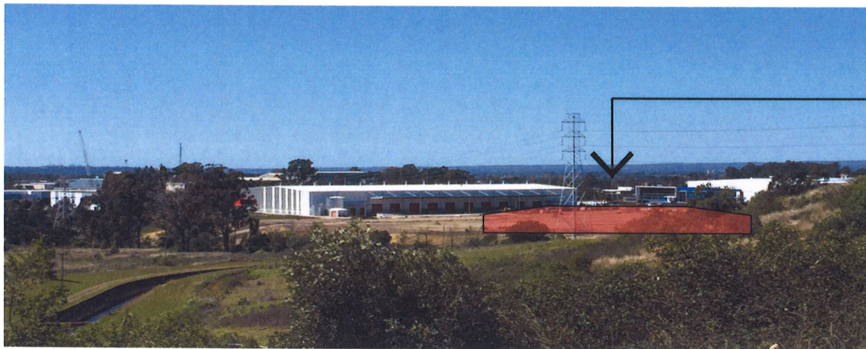
PROPOSED BUILDING VIEWED FROM FERRERS RD.