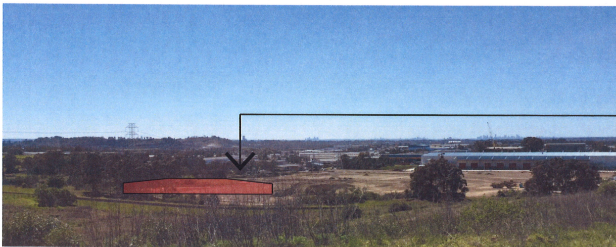
PROPOSED BUILDING VIEWED FROM FERRERS RD. NEAR THE HORSLEY DR

04 VIEW 04 FERRERS RD. NEAR THE HORSLEY DR.