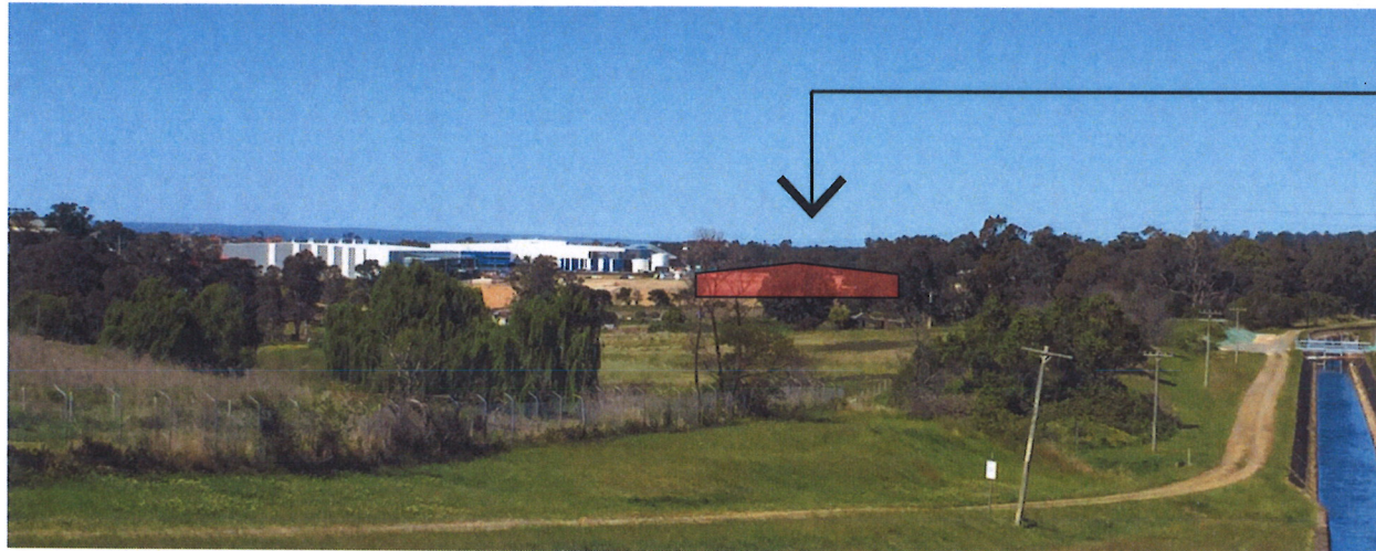
PROPOSED BUILDING VIEWED FROM CHANDOS RD.