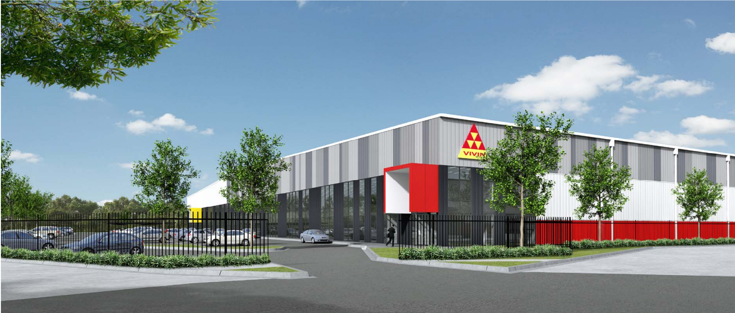
01 BURILDA CLOSE CUL DE SAC PERSPECTIVE - N.T.S.