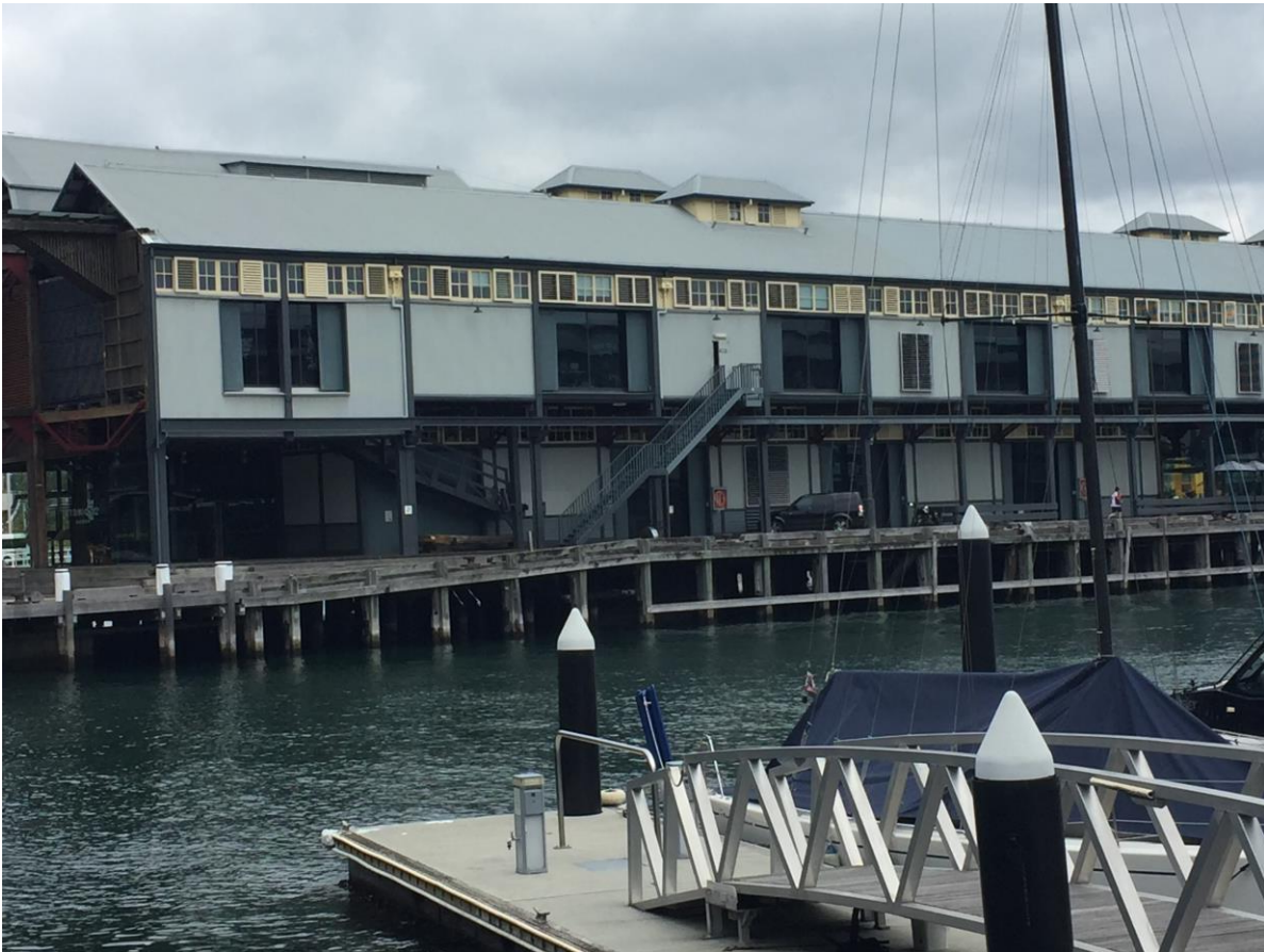
Precinct stair orientation precedent