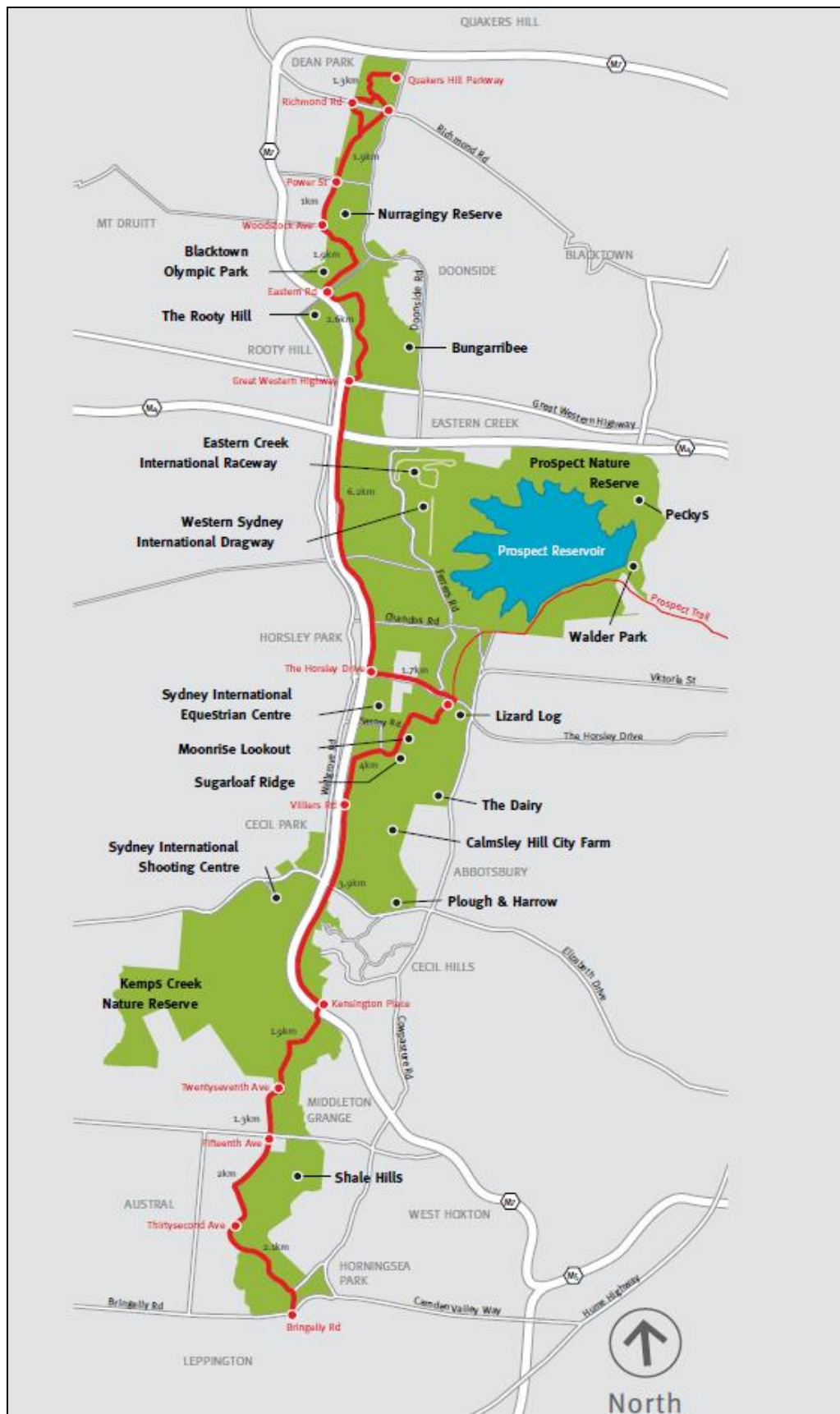
Figure 3 Western Sydney Parklands Extent

Proposed Lot 4, Horsley Drive Business Park