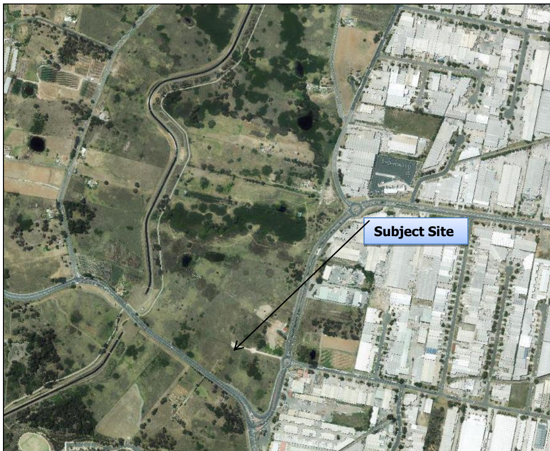
Figure 2: Subject Site (SIX Maps, 2016)

Figure 2 below provide an overview of the site layout (as existing) and the surrounding land uses.