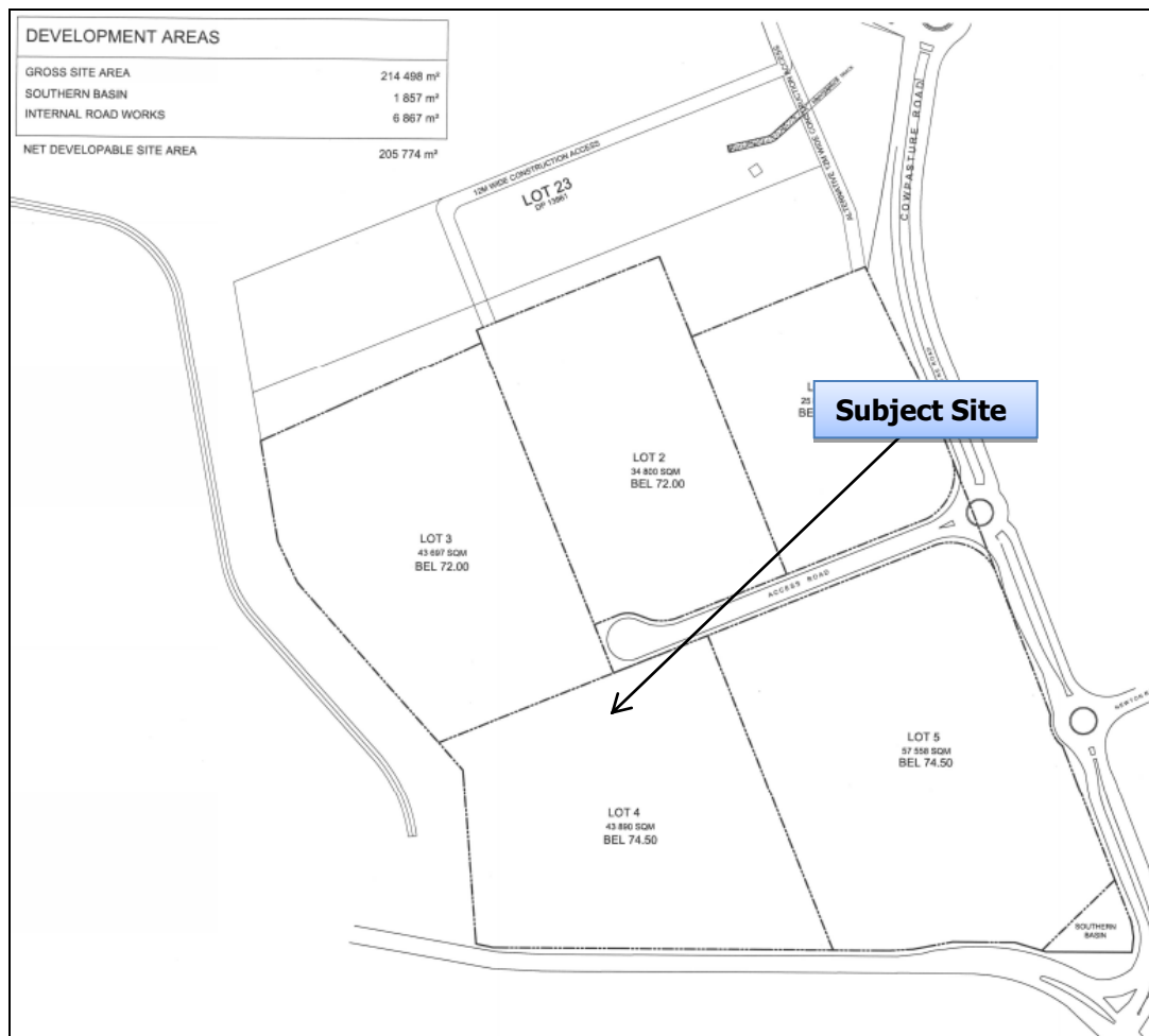
Figure 1 Approved MOD 3 SSD 5169 Master Plan (Australand 2015)

Proposed Lot 4, Horsley Drive Business Park