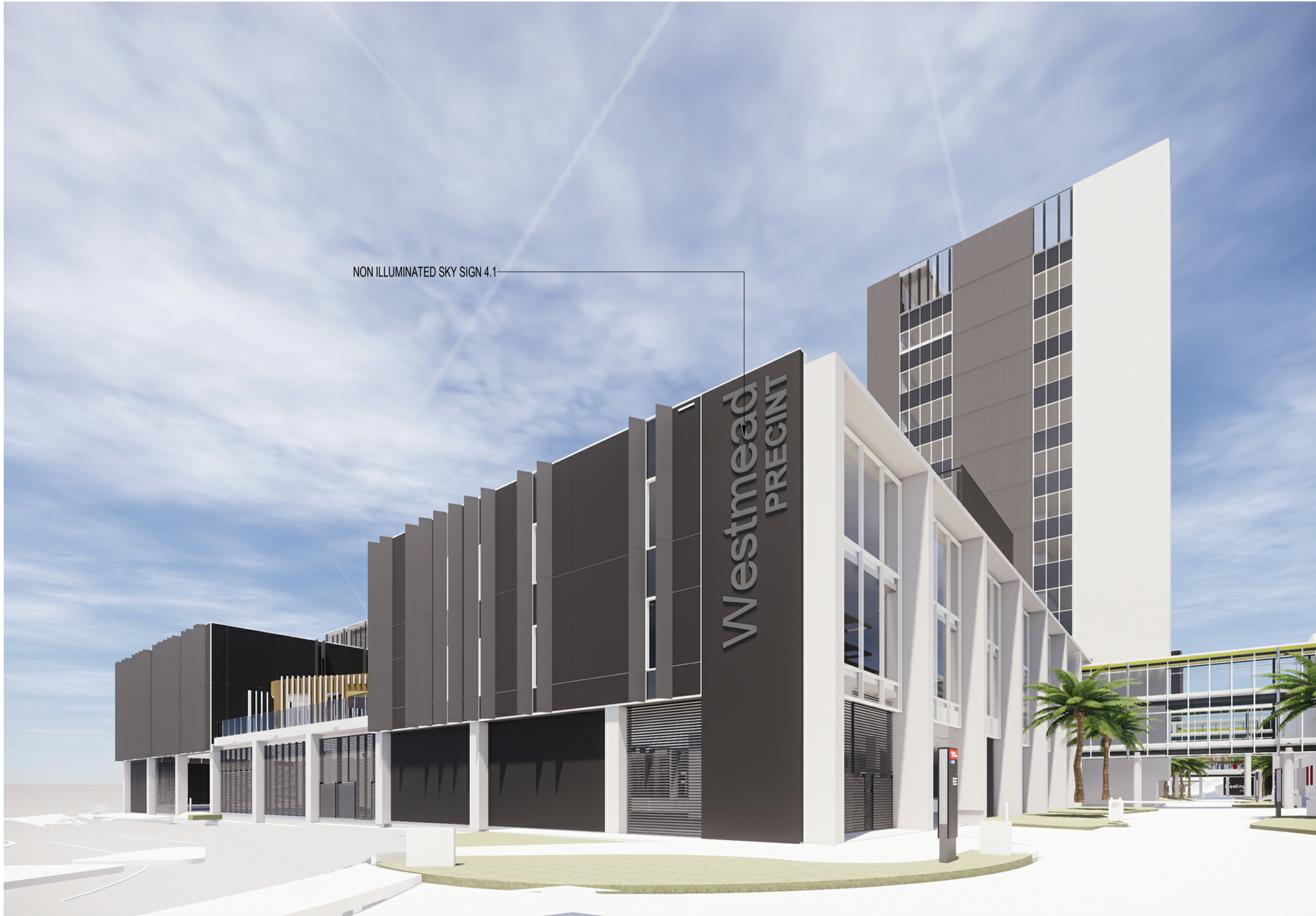
3 SKY SIGN INDICATIVE VIEW 03 1 : 10