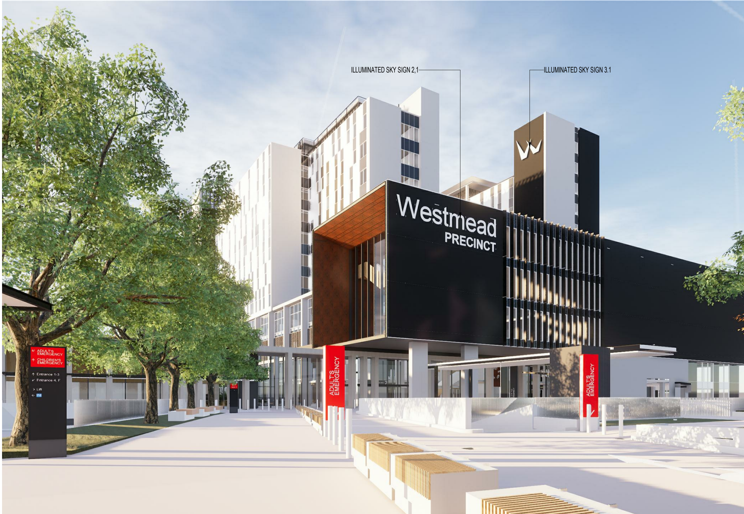
2 SKY SIGN INDICATIVE VIEW 02 1 : 10