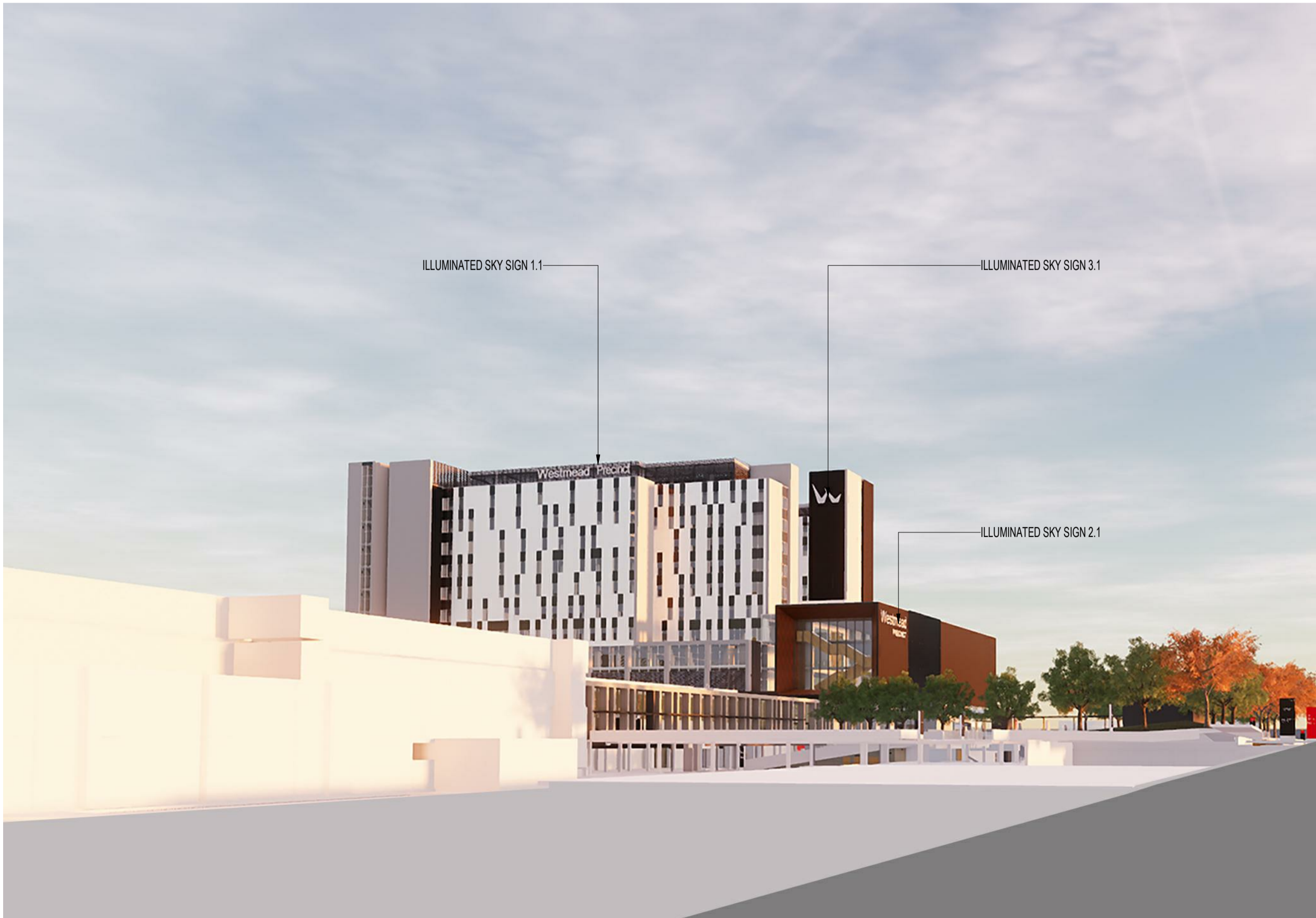
4 SKY SIGN INDICATIVE VIEW 04 1 : 10