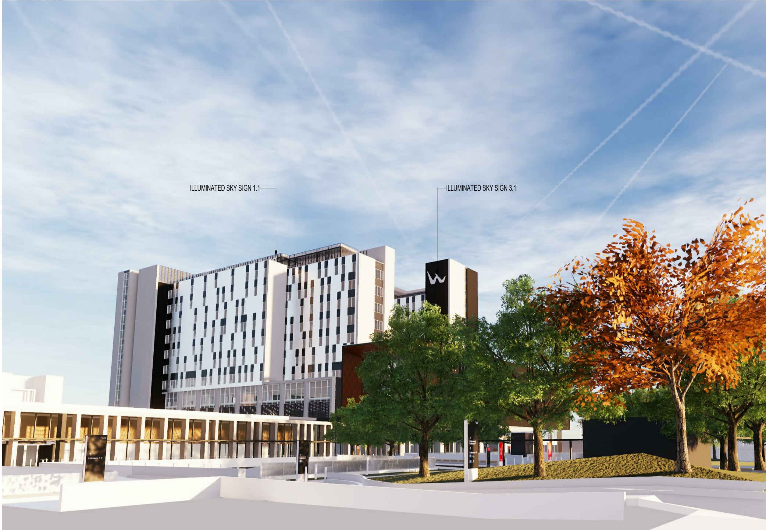
1 SKY SIGN INDICATIVE VIEW 01 1 : 10