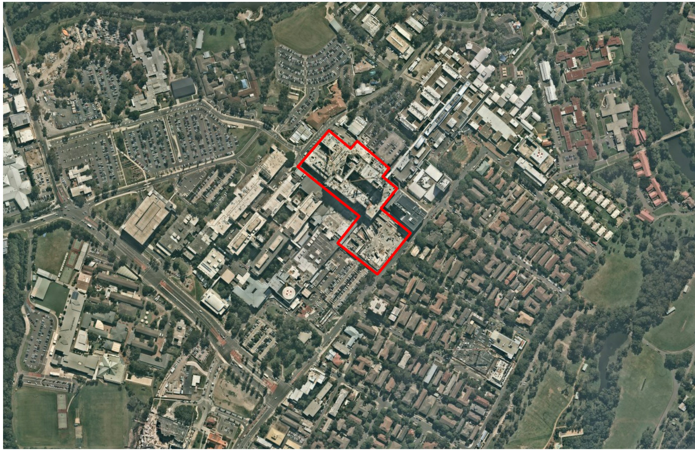
3 LOCATION PLAN 1 : 1000