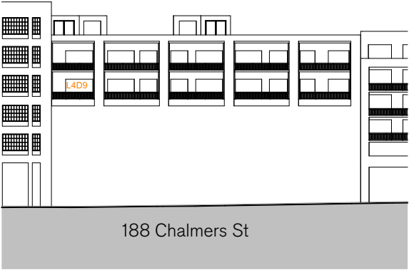
Elevation Chalmers St 1:500