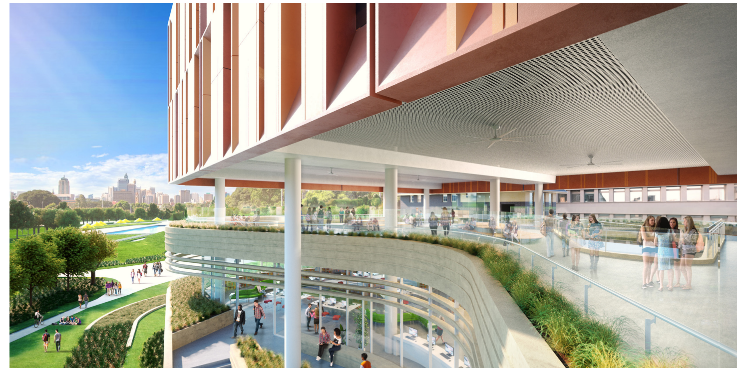
View from Student and Community Hub towards Prince Alfred Park.

As outlined in Section 9.0 Educational Planning Strategies, “the configuration of spaces creates a vibrant and active street level accessible to the public and linked to gathering spaces, meeting spaces, performance spaces and sports facilities above and below to the main community hub. This can be used by students for study and might possibly serve as a more convenient study location for local students from other learning institutions. The learning and meeting areas within this space might also attract business and community groups seeking new spaces to collaborate and network.”