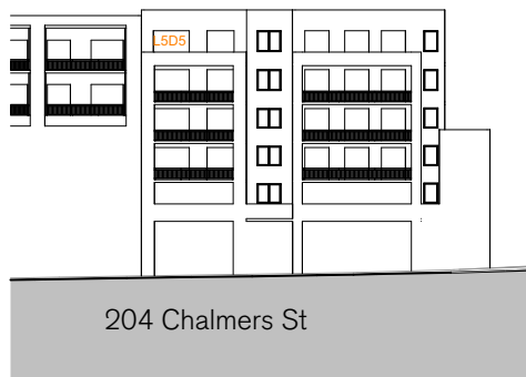
Elevation Chalmers St 1:500