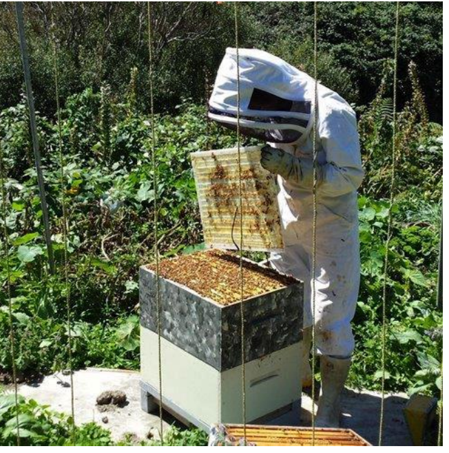
BEEHIVES HONEY COLLECTION 3