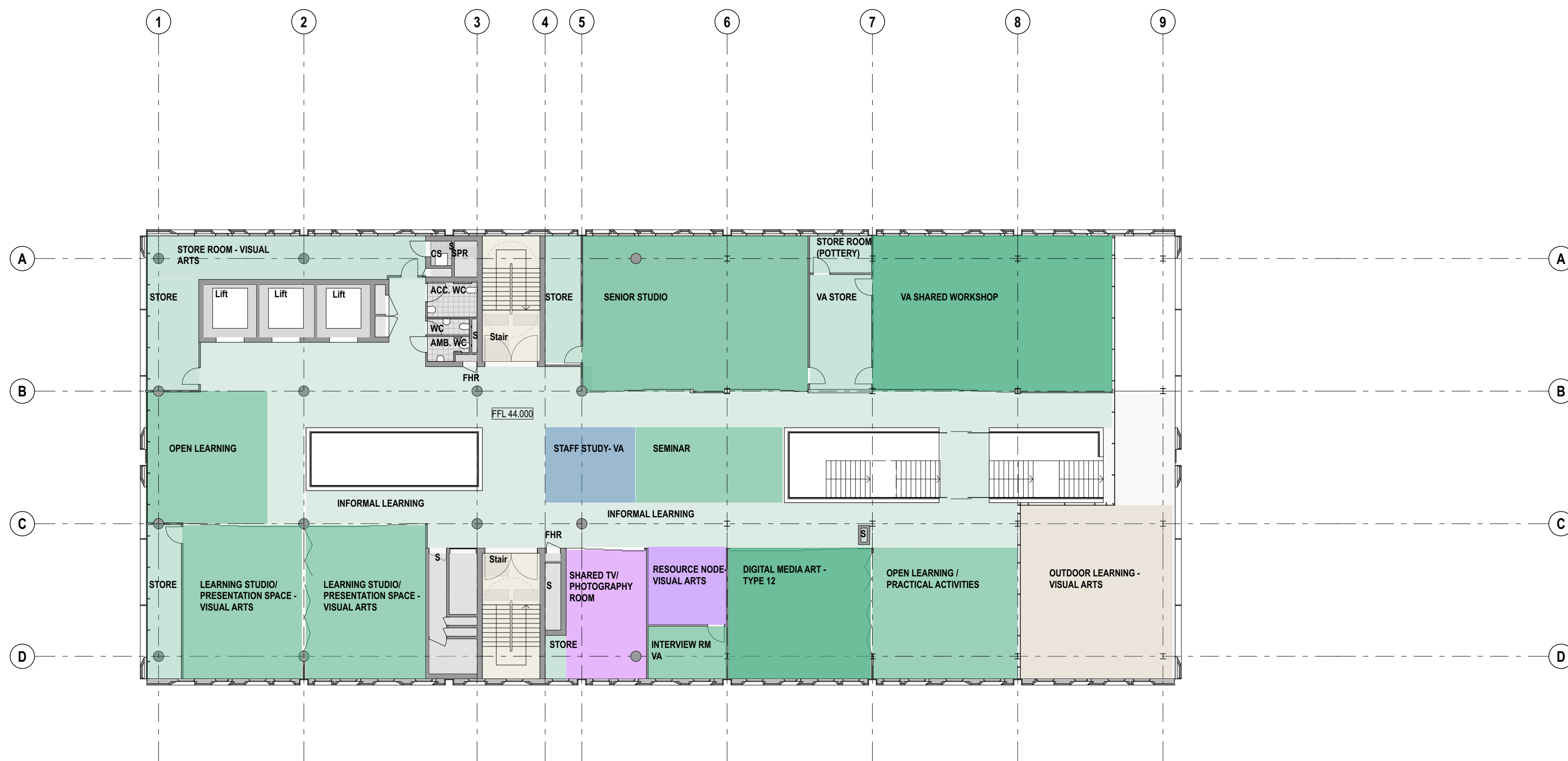
2 PLAN Level 3 1:200