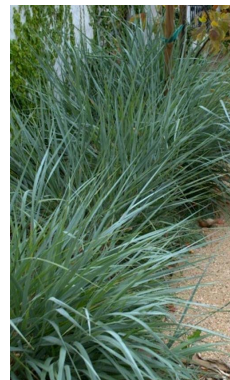
Plant species palette