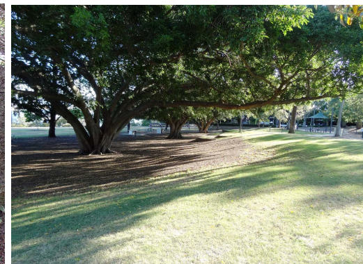
Existing park trees