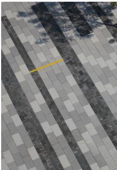
2 STONE PAVING WITH CURVED BANDING