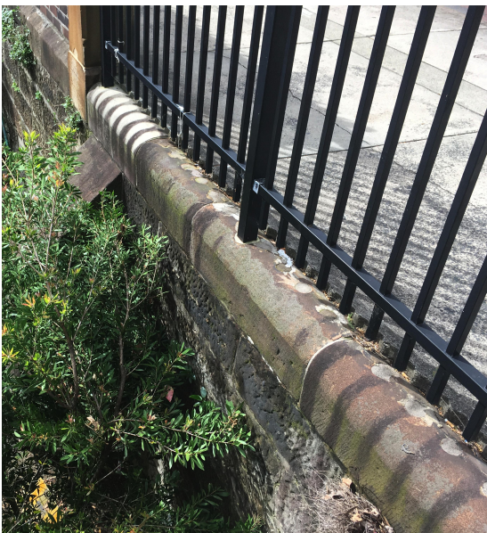
3 EXISTING HERITAGE SANDSTONE TO BE RETAINED AND PROTECTED