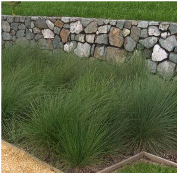
17 NATIVE GRASSES