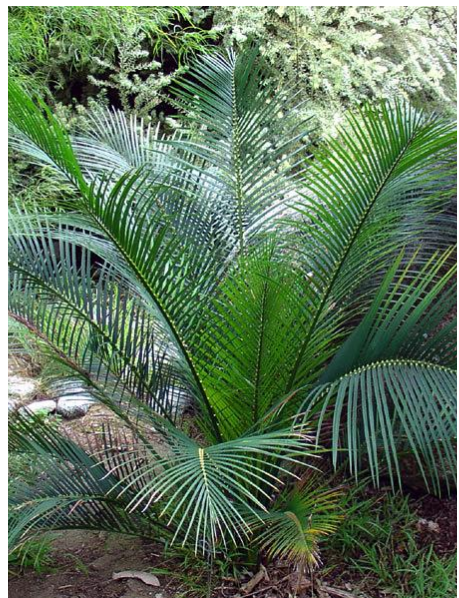
11 MACROZAMIA COMMUNIS