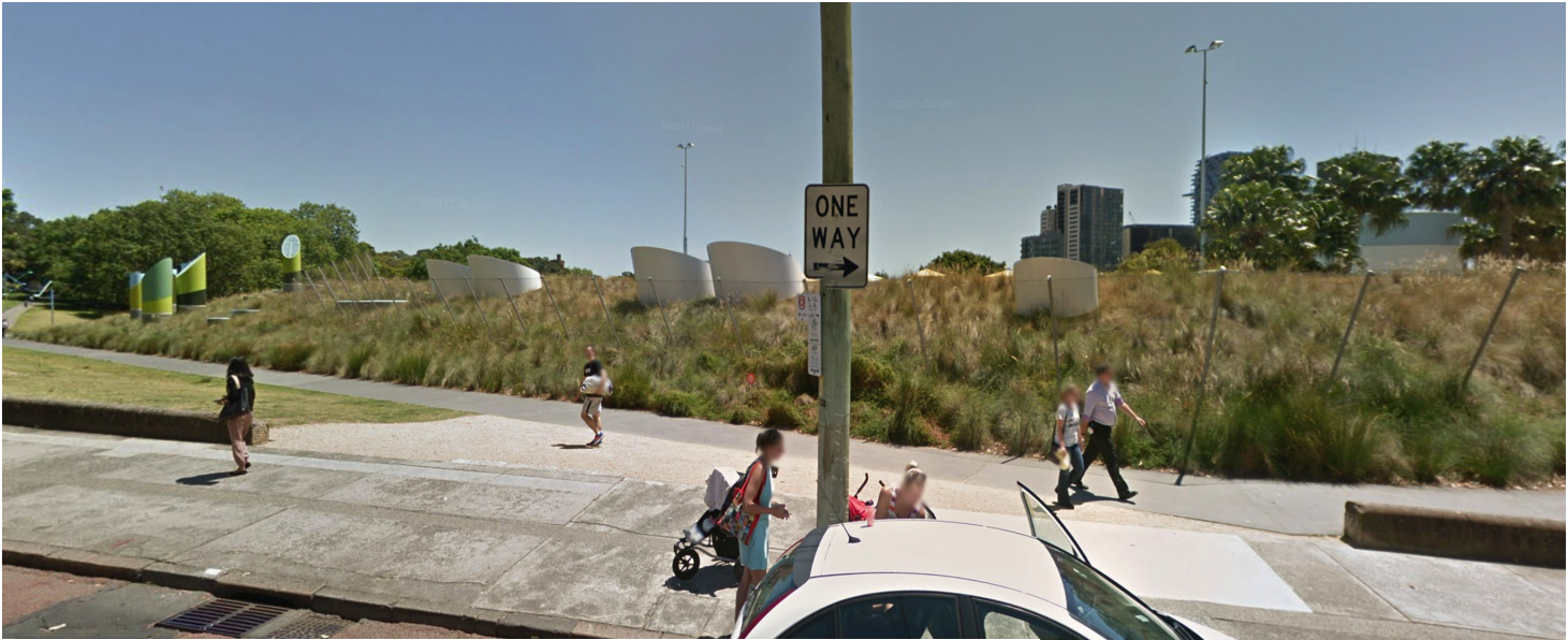
IMAGE 2: VIEW OF A SIMILAR EXAMPLE FURTHER DOWN CHALMERS ST IN FRONT OF PRINCE ALFRED PARK POOL WHERE A LARGE PORTION OF THE PLINTH HAS BEEN REMOVED.