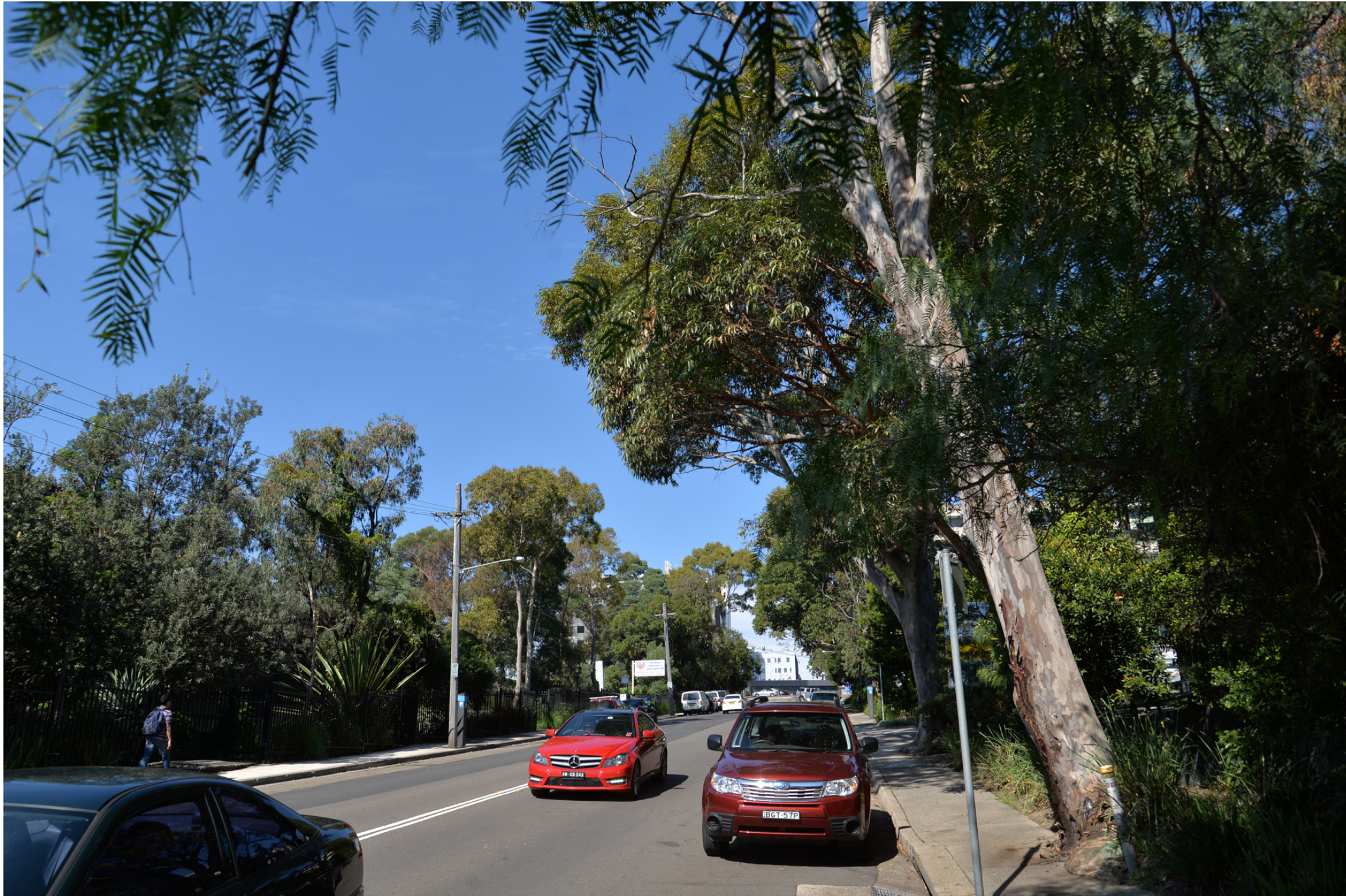
VIEW D, From Intersection Of Reserve Rd & Frederick St