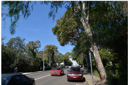
CURRENT VIEW D