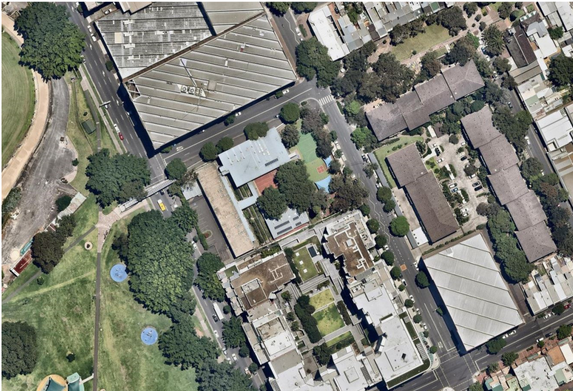
Aerial photo of the site and surrounds

The purpose of this Built Form and Urban Design Report is to analyse the urban character of the existing built form and provide a summary of the urban design response and strategies which are embodied in the proposed design for the Ultimo-Pymont Public School and as detailed in the Environmental Impact Statement.