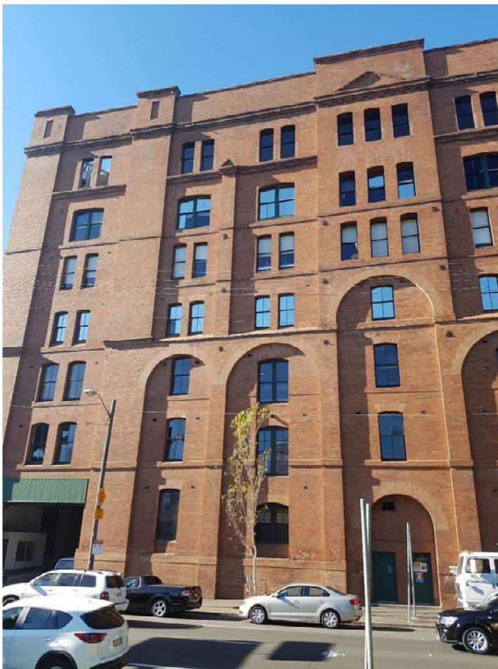
Heritage-listed former Elder Smith & Co. Wool Store 45 Jones Street, Ultimo opposite Ultimo-Pyrmont Public School

The Ultimo-Pyrmont Public School site is bounded on its 4 frontages with mature trees lining the footpaths. The street frontages are surrounded by quite different built forms. To the east along Jones Street is a combination of 2-storey Victorian terraces and a modern development of single storey retail shops with 4-storey brick apartment behind. To the north along Quarry Street is the impressive former Elder Smith & Co wool store, a 4 to 7-storey brick building that was typical of the area along Wattle Street. To the west across Wattle Street is Wentworth Park with open space and mature fig trees. Quarry Street is connected to the park over Wattle Street by a pedestrian bridge which the school uses to take students for sport and outdoor activities. To the south is a 5-storey contemporary apartment complex that steps down its site to Wattle Street. It is of rendered masonry construction.