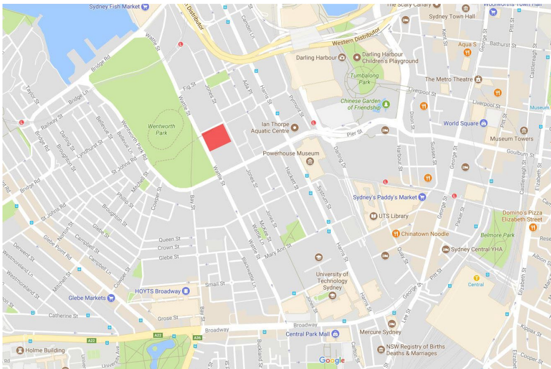
Map of Ultimo precinct with the school site marked in red

A steel and concrete footbridge over Wattle Street connects Wentworth Park to Quarry Street. The site, currently occupied by the Ultimo-Pymont Public School, is part of a natural rock outcrop that stretches over 500m from William Henry Street to the Sydney Fish Market.