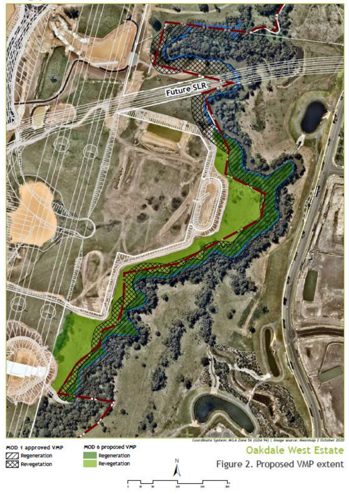
Figure 10: Stage 1 Vegetation Management Plan (MOD 6)