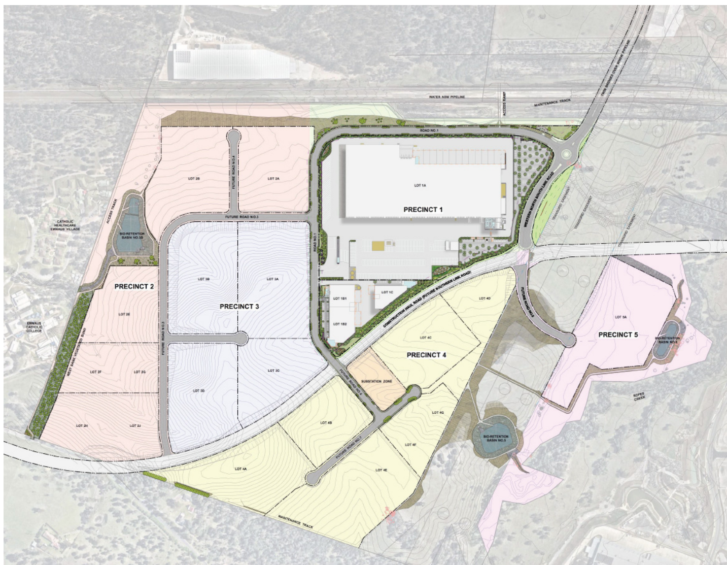
Figure 4: Stage 1 Landscape Plan