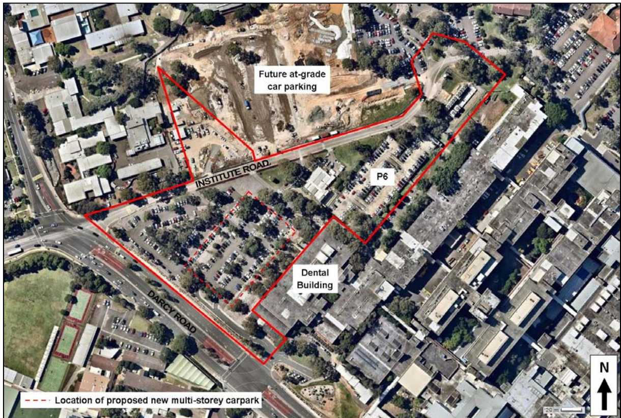
Figure 2: Existing site layout

The proposed carpark is located on the north-western edge of the Westmead Health Precinct on Lot 1 DP 1194390 and Lot 4 DP 107785. The hospital campus includes a range of hospital buildings varying in height from single storey up to eight storey buildings. The development site is bounded by: Institute Road and future at-grade car parking approved under separate approval (refer to section 1.3) to the north-east; an existing carpark (P6) and Westmead Centre for Oral Health building (Dental Building) to the south; and Darcy Road to the south-west (refer to Figure 2 ).