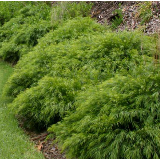
Acacia cognata "limelight"