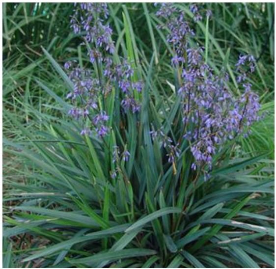
Dianella caerulea "littel Jess"