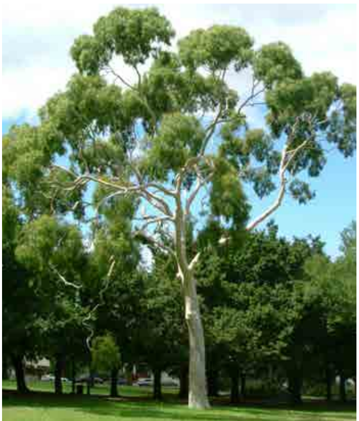
Corymbia citridora "Scentuous"