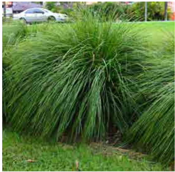
Lomandra longifolia "Tanika"