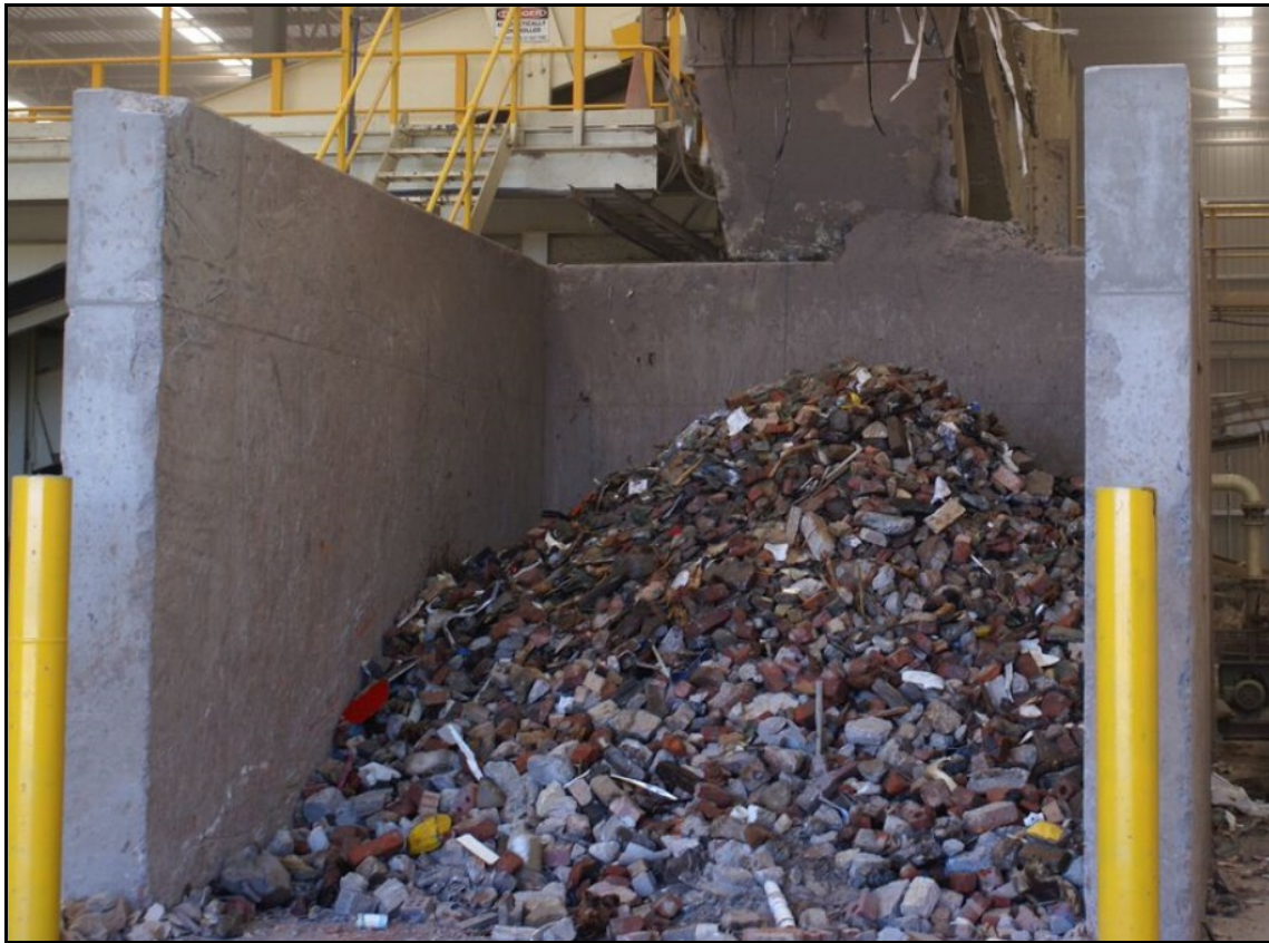
Photograph: This photograph shows an example of the bunkers which storage co-mingled material prior to being loaded into trucks to be taken off site for further recycling.