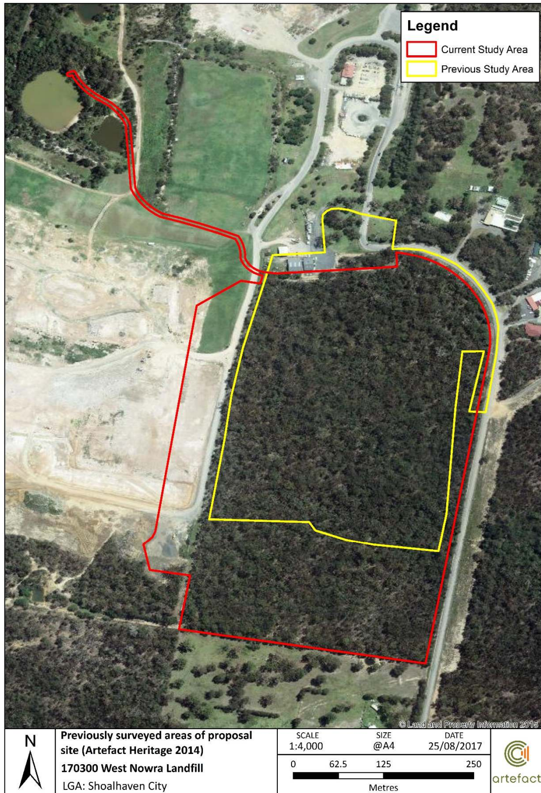
Figure 1.3: Study area for addendum survey