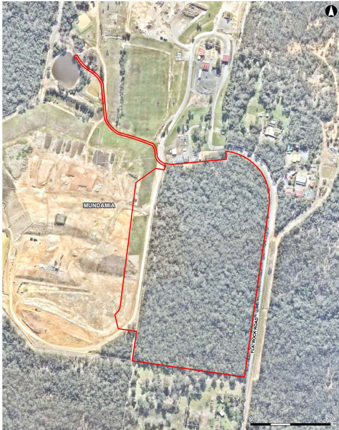
Figure 1.2: The Proposal Site