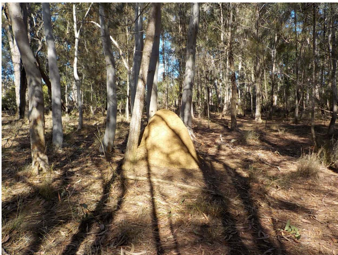
Figure 6.3: Ground surface visibility survey unit 4