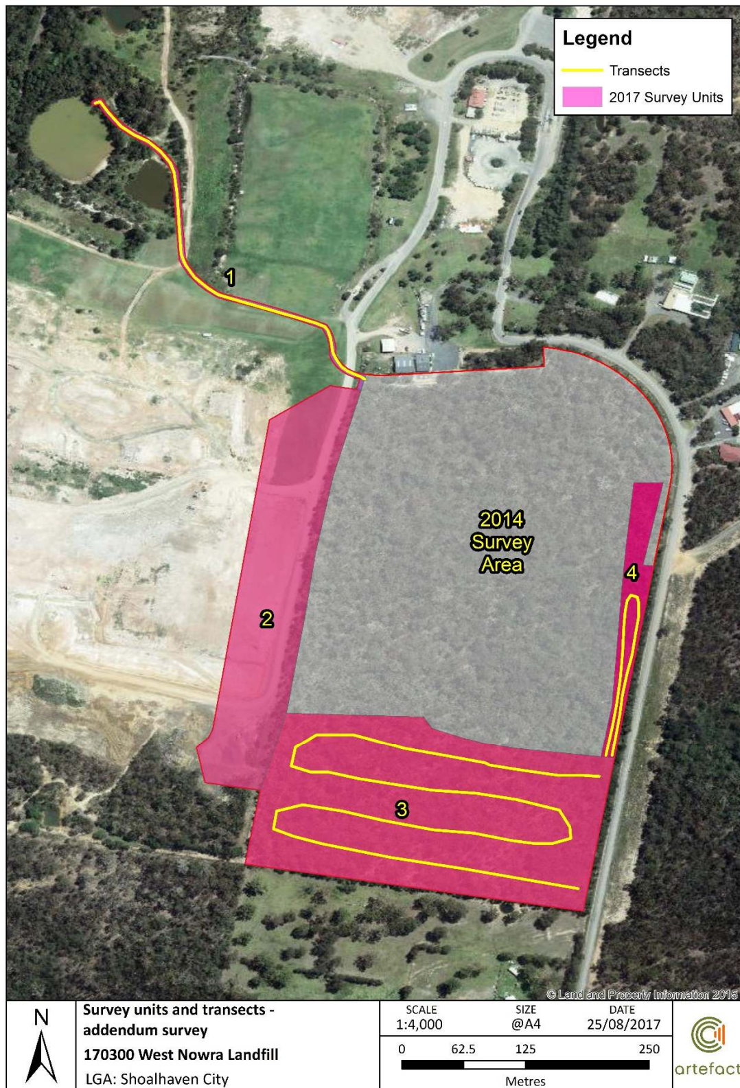
Figure 6.1: Survey units and transects