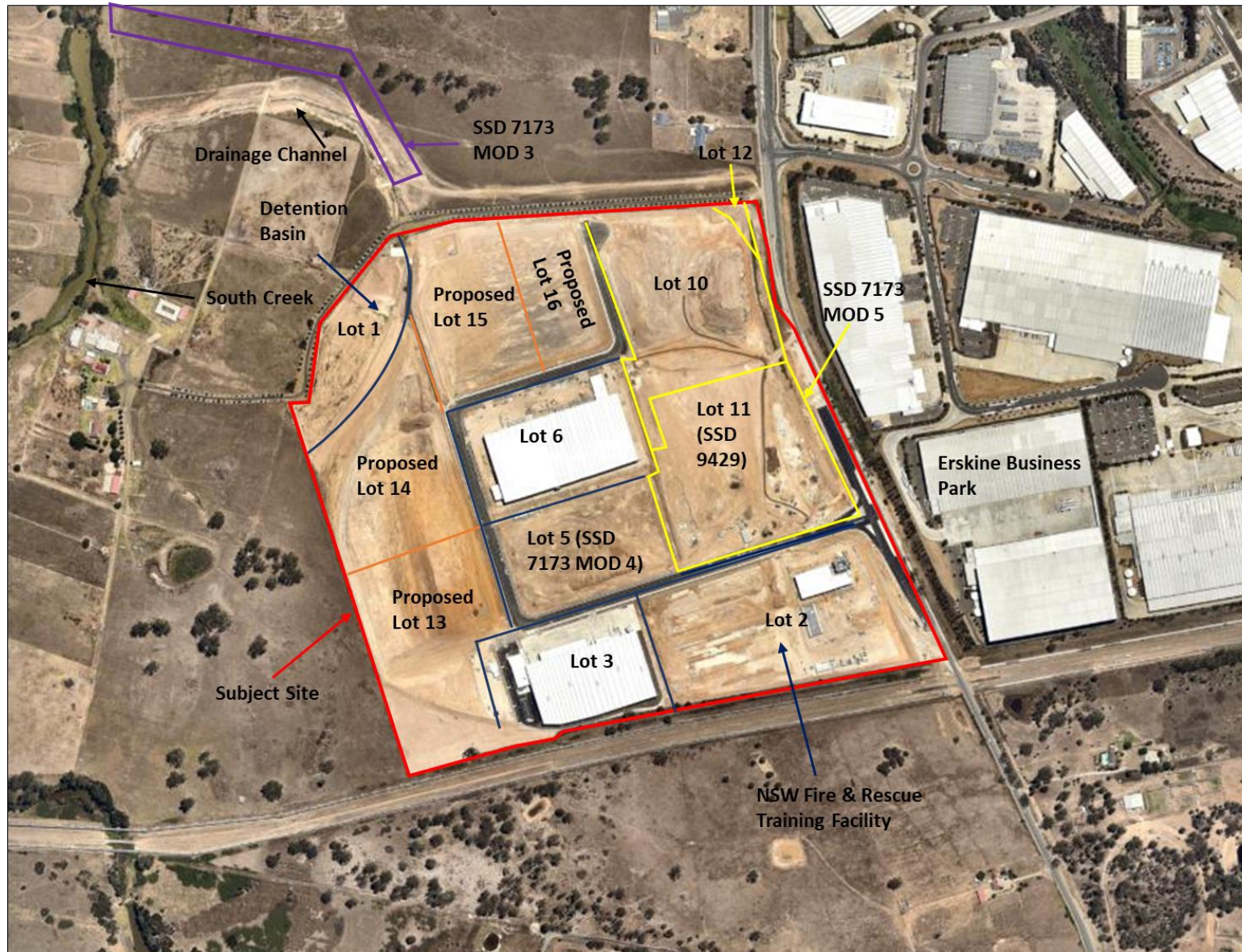
Figure 2 Proposed Site Layout Subject to this Modification Application for Purposes of a Proposed Subdivision

Warehouse and Logistics Hub - 585-649 Mamre Road, Orchard Hills