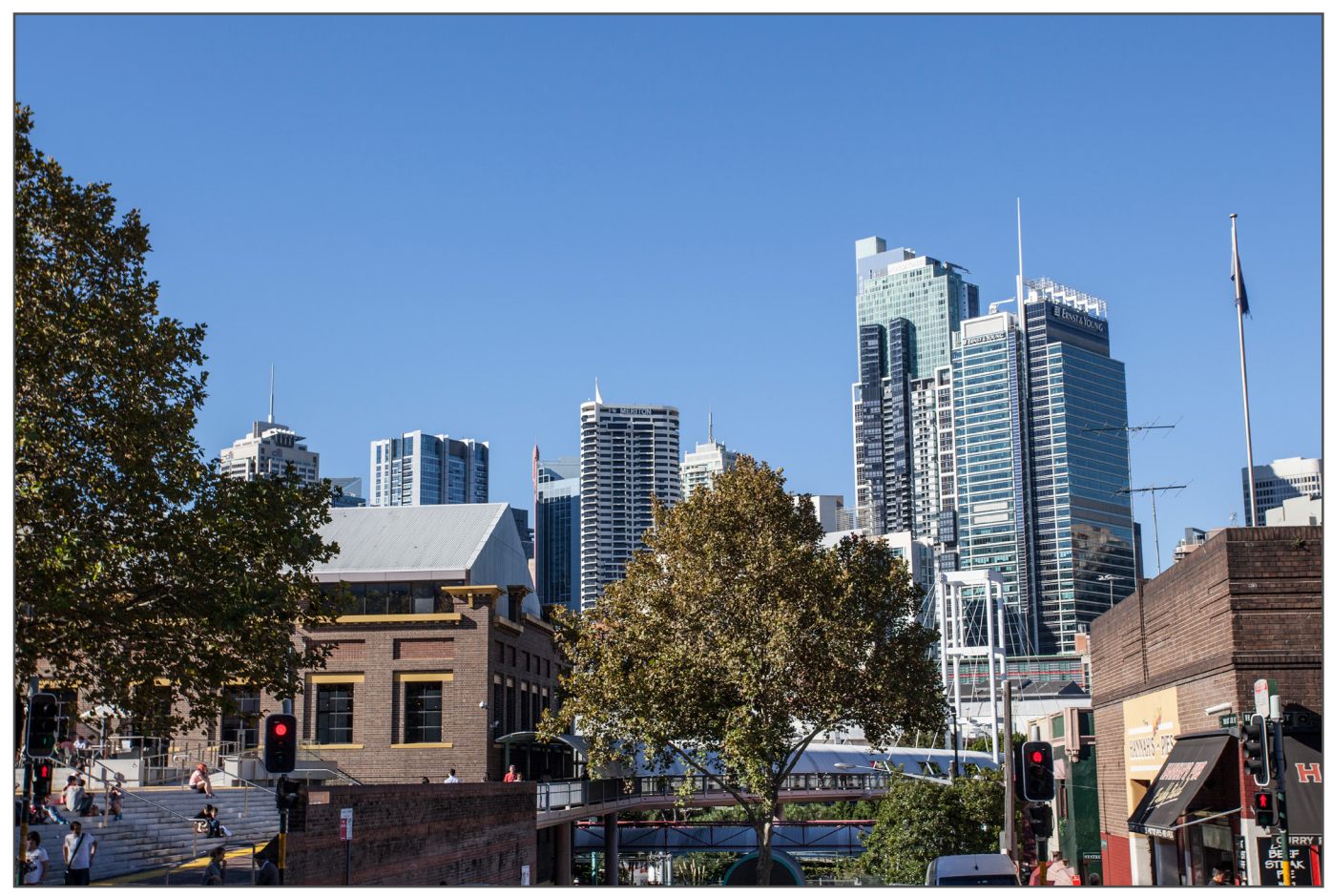
50mm - Original Image