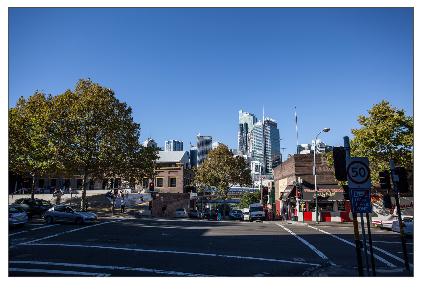
24mm - Original Image