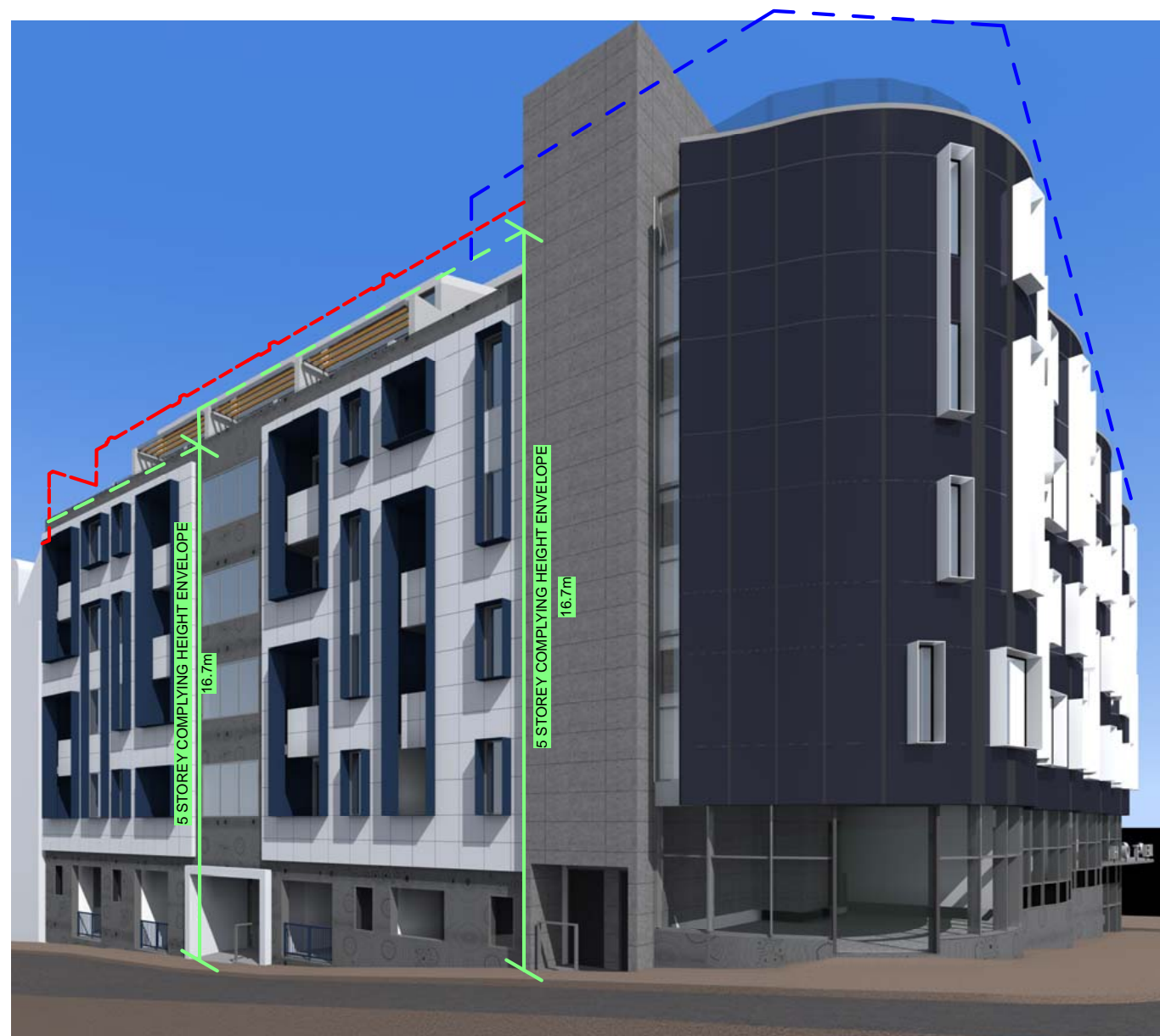
View from North East