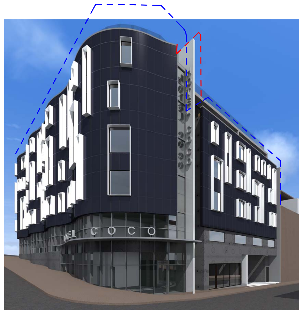
View from North West