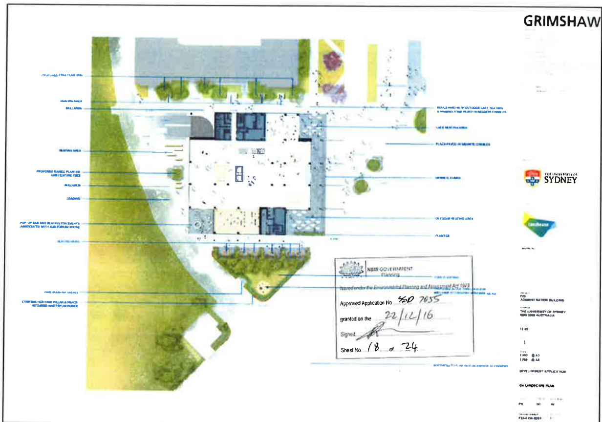
Figure 2 Approved Landscape Plan

The application seeks to amend Condition A2 to alter the approved Landscape Plan. The amended Landscape Plan shows the public art display relocated to the south eastern podium of the F23 site and the replacement of a Port Jackson Fig tree within the southern triangular landscaped area with an advanced Moreton Bay Fig tree (see Figure 2 and 3 ).