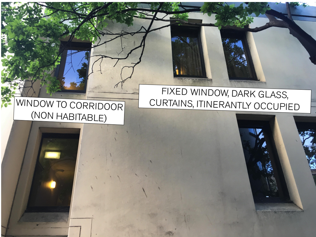
4 IMAGE Image of Rendezvous Hotel NTS