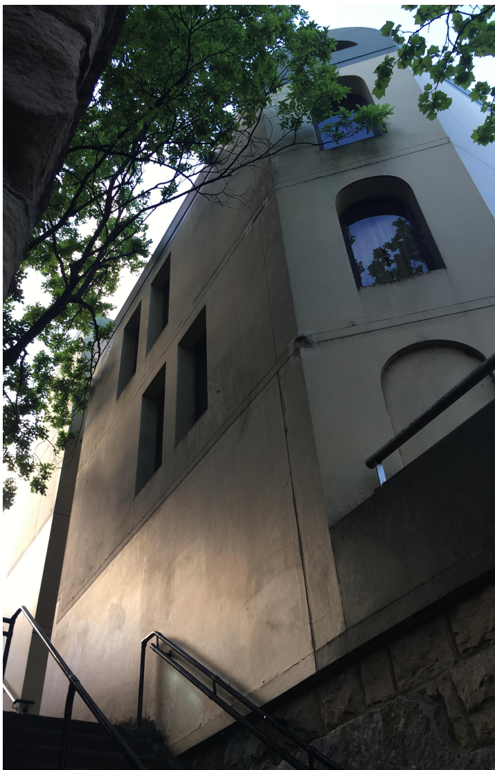
2 IMAGE Image of Rendezvous Hotel NTS