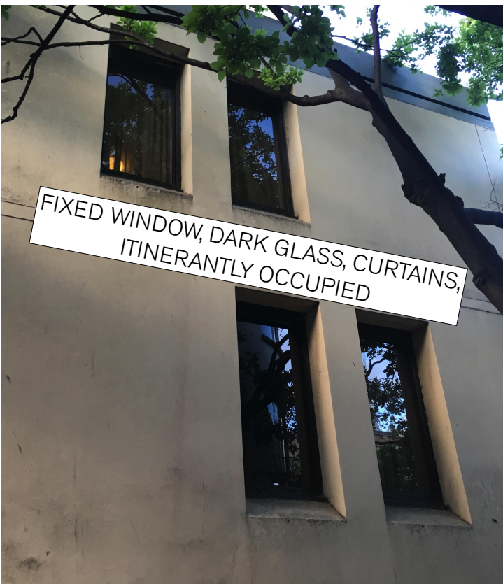
3 IMAGE Image of Rendezvous Hotel NTS