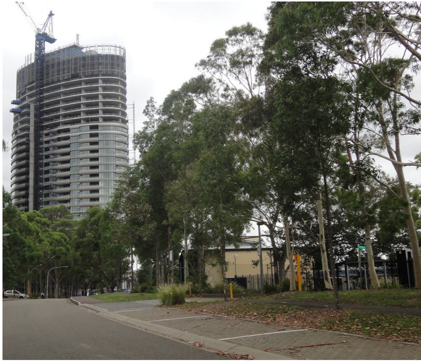
SITE 53 FROM FIGTREE DRIVE Looking East onto Site 53, 2 Figtree Drive, with Australia Towers in the back-ground