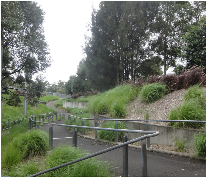
LOOKING WEST INTO LINEAR PARK Existing landscaping and footpath of the linear park along the southern boundary of the site.