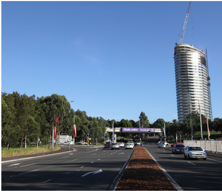
LOOKING NORTH UP AUSTRALIA AVENUE Site 53 on the left obscured by trees, with the rail and pedestrian overpass crossing Australia Avenue.