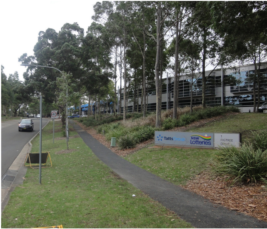
1 FIGTREE DRIVE The neighbouring building to the north of the site