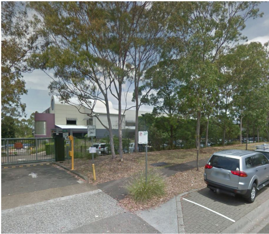
4 FIGTREE DRIVE The existing Fujitsu Australia building neighbouring to the west of the site