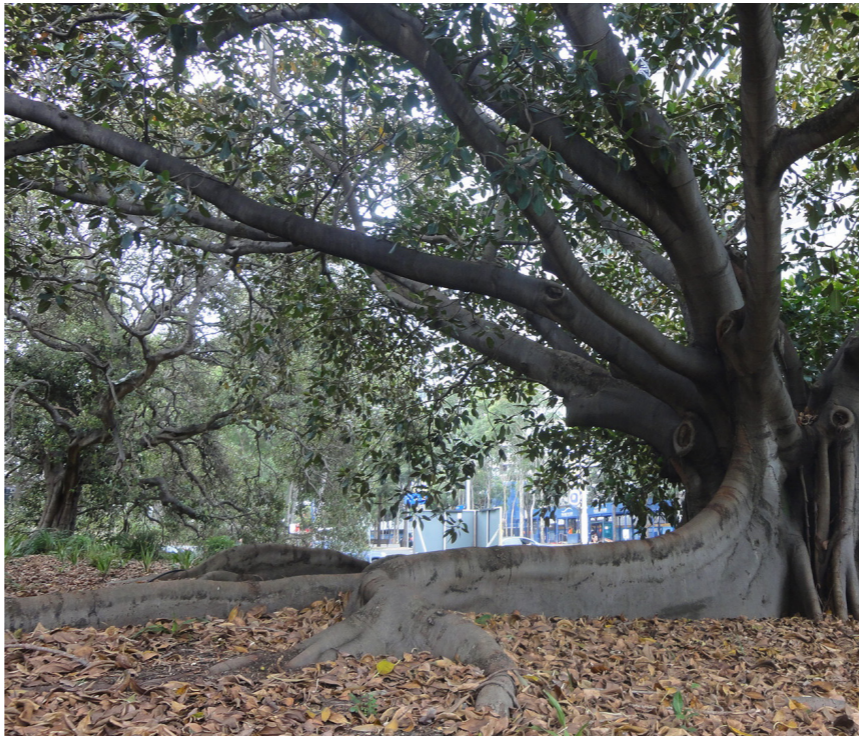
EXISTING FIG TREES ON SITE The two existing fig trees on the North-East corner of the site.