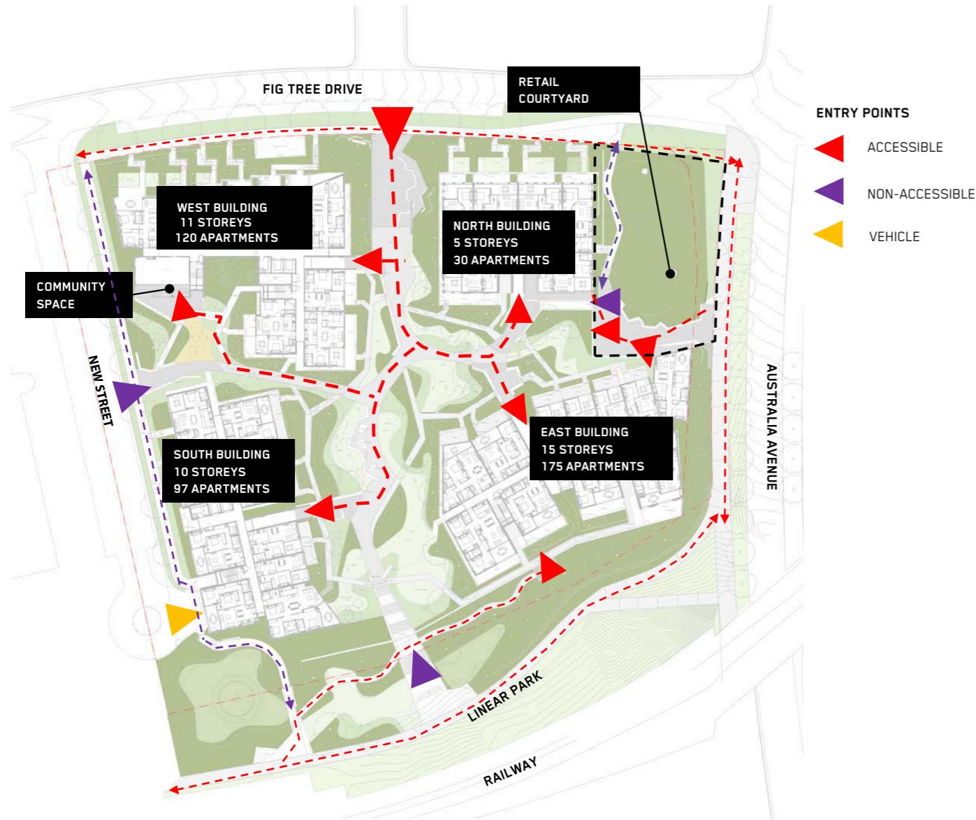
SITE ACCESS AND MAIN BUILDING ENTRIES