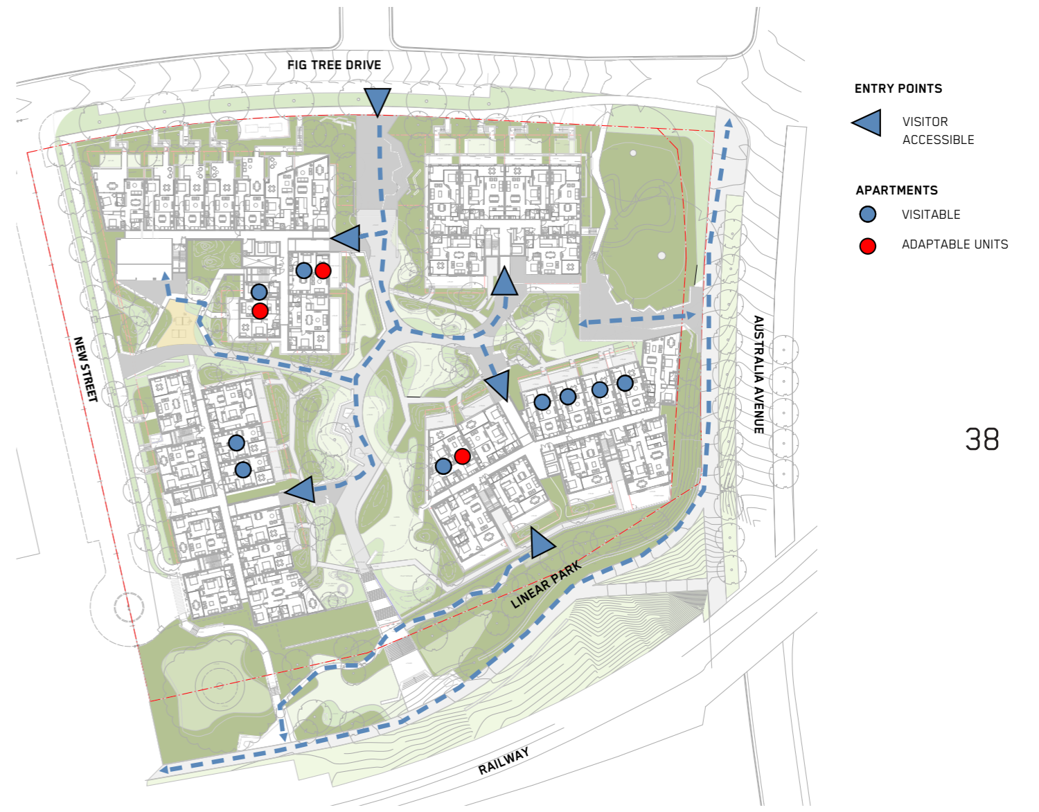
GROUND PLANE ACCESSIBILITY