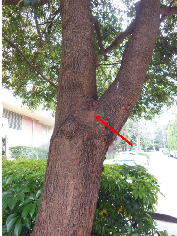
Photograph 1: Tree # 1 – Illustrating the codominant leaders from 1.7 metres with some evidence of poor attachment at the junction.