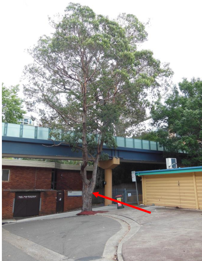
Photograph 4: Tree # 3 – Illustrating the location and context.