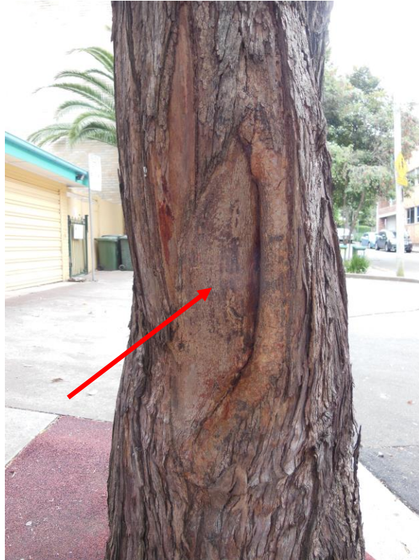
Photograph 5: Tree # 3 – Illustrating the evidence of past mechanical injury on the south side at 0.6 to 1.4 metres.