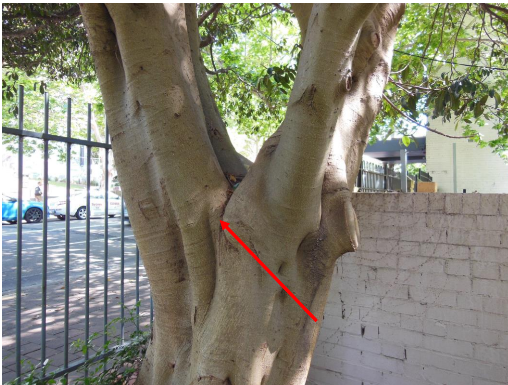
Photograph 7: Tree # 10 – Illustrating the multiple, codominant leaders from 1.3 metres with some evidence of poor attachment at the junction.