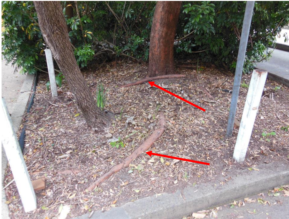
Photograph 2: Tree # 1 – Illustrating the exposed woody roots adjacent infrastructure.