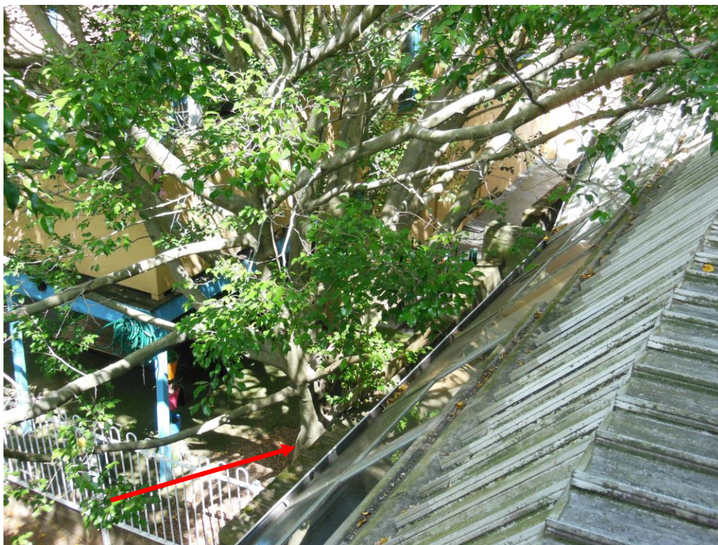
Photograph 8: Tree # 8 – Illustrating the close proximity to buildings, retaining walls etc.