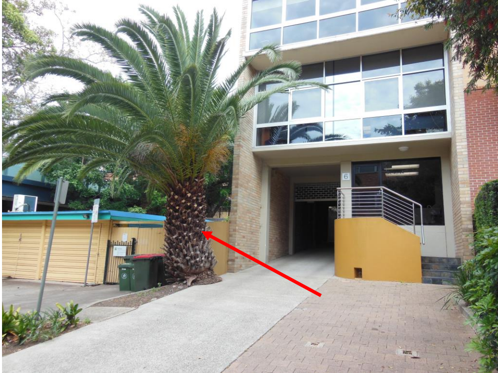
Photograph 3: Tree # 2 – Illustrating the location and context.