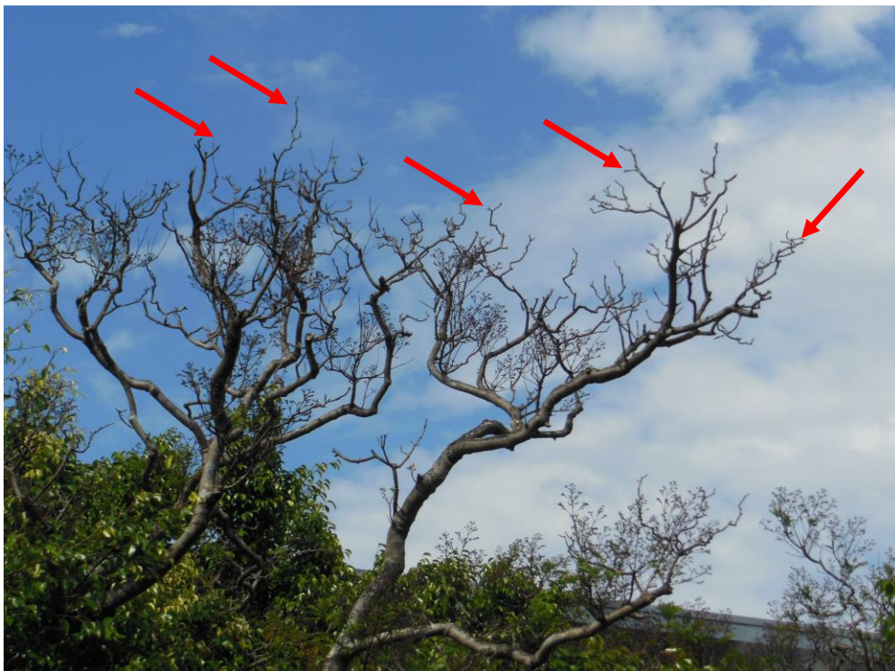
Photograph 6: Tree # 7 – Illustrating the moderate levels of dieback in the upper canopy.