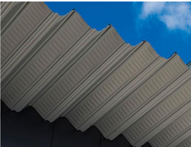
I METAL ROOFING