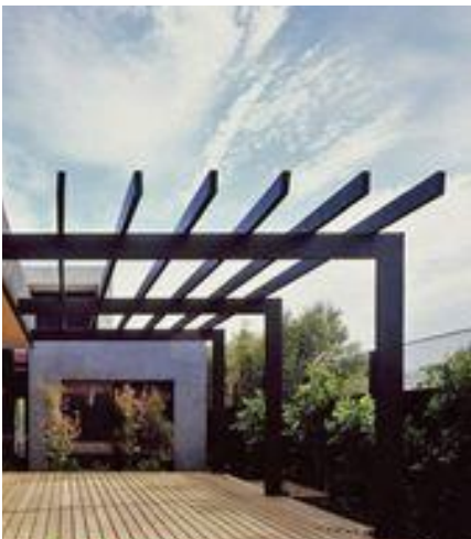
J METAL SCREENING