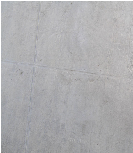
L CONCRETE WALLS