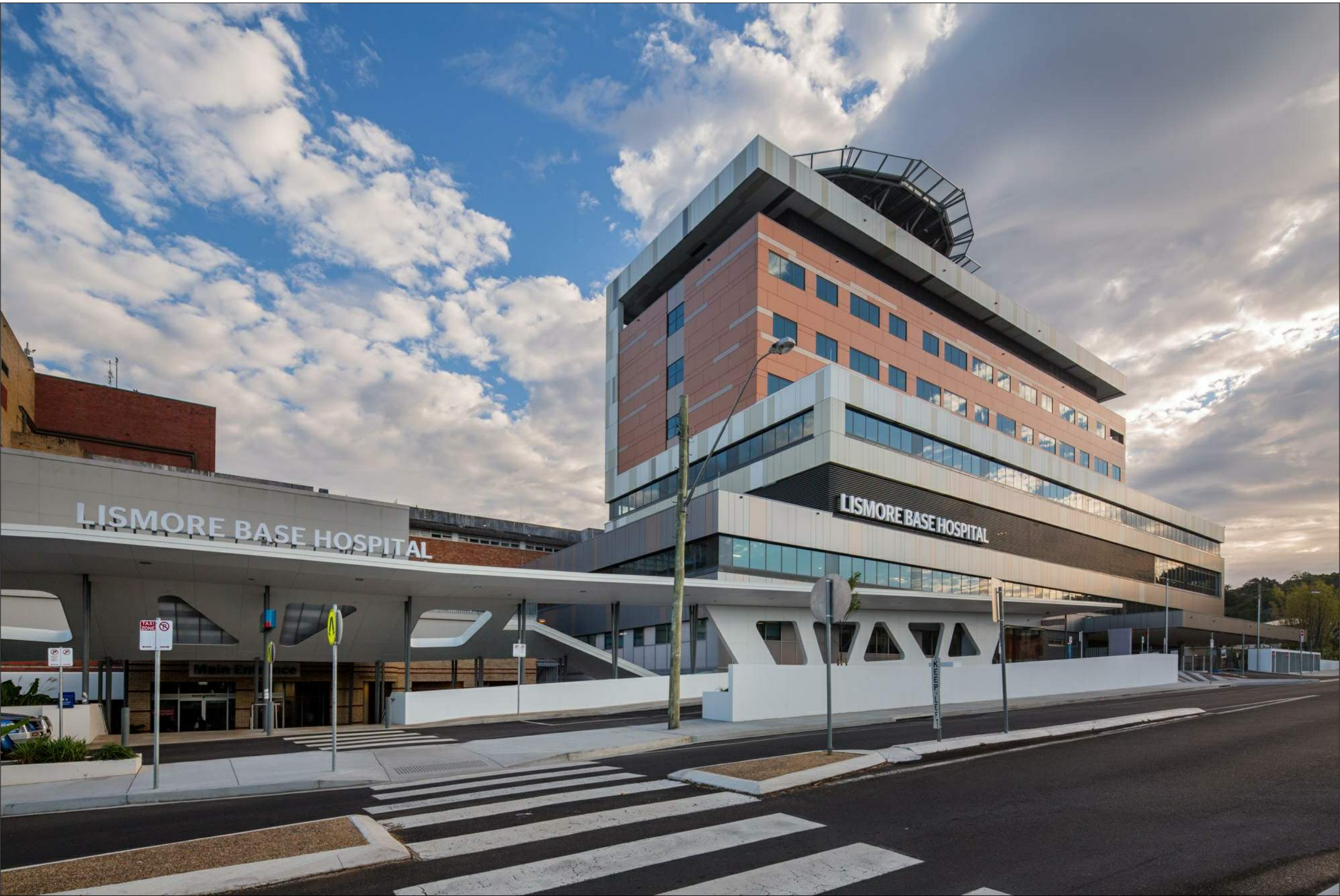
Existing - Vantage Point D