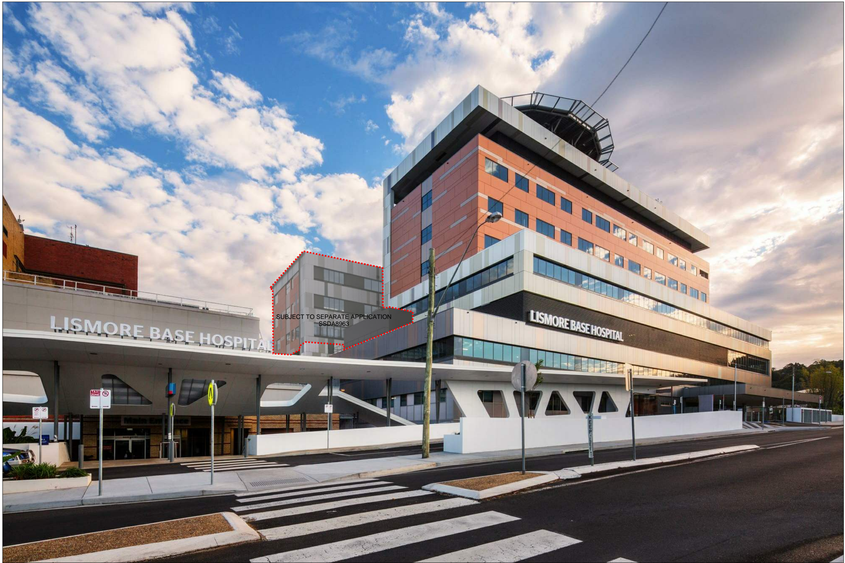
Proposed - Vantage Point D