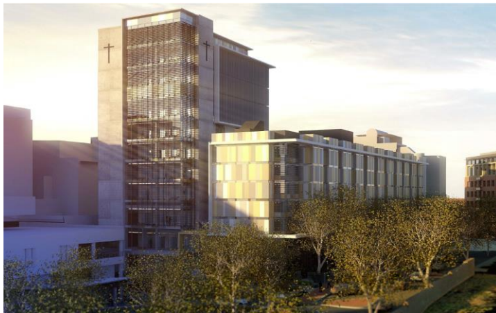
Figure 4 – The development, as proposed