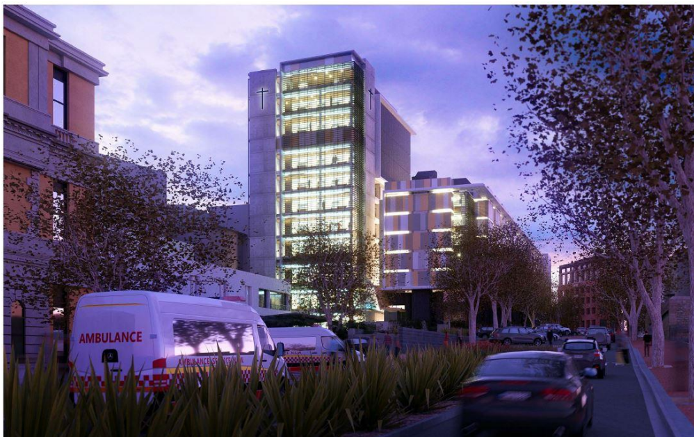
Figure 1 – Proposed signage

The proposed modifications also comprise the removal of the external back-lit building identification sign comprising the St Vincent's Hospital logo from the western (Victoria Street) façade, however seeks to retain the originally proposed cross on this elevation.