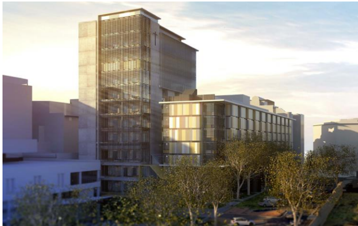
Figure 3 – The development, as approved

Notwithstanding these changes, the facades of the high-rise and East Wing buildings maintain a vertical expression and colour pallet reflective of the surrounding streetscape, as show in the approved and proposed photomontages at Figures 3 and 4 .