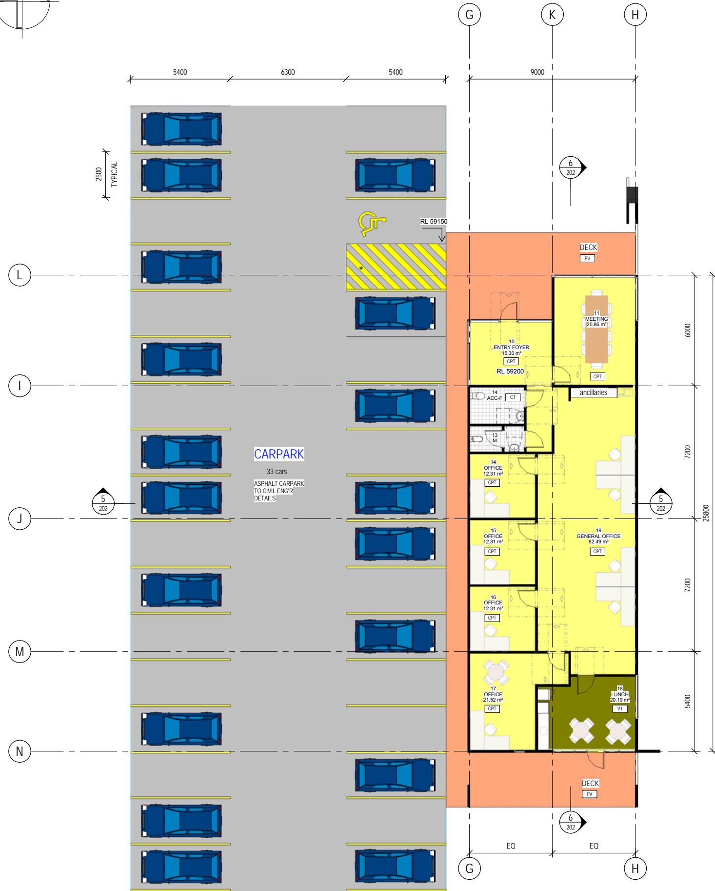
1 Office 1 1 : 100